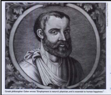
Greek philosopher Galen wrote: "Employment is nature's physician, and is essential to human happiness."

Employment is nature's physician and is essential to human happiness.