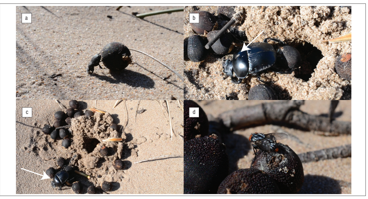
Figure 1: (a) Epirinus flagellatus rolling a Ceratocaryum argenteum seed; (b) Scarabaeus spretus rolling a seed (the arrow indicates a sphaerocerid lesser dung fly); (c) the large hole made by S. spretus for burying several seeds (the arrow indicates the location of the dung beetle); and (d) a female sarcophagid fly on a seed.