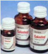
Figure 3. Galastop®. A commercial preparation of the dopamine agonist cabergoline, marketed in Europe by Vetem for treatment of canine pseudopregnancy, is available as a suspension in liquid for oral administration. - To view this image in full size go to the IVIS website at www.ivis.org . -

Cabergoline - Cabergoline has greater bioactivity, superior D2-receptor specificity, and a longer duration of action compared to bromocriptine. The biopotency is greater than some anti-prolactin dopamine agonists used in human medicine (tergulide and lisuride) and is about equivalent to that of pergolide. It can be effectively administered once a day. Cabergoline crosses the blood brain barrier only slightly and consequently has much less central emetic effects than some other dopamine agonists [2,4,32,52]. The ED50 for emesis is 4 times the therapeutic dose and gastrointestinal signs are rare [11]. Cabergoline (Galastop®) is marketed as a veterinary drug in several European countries with an indication for use in pseudopregnant bitches at a dose of 5 µg/kg/day for 5 to 10 days, given orally (Fig. 3).