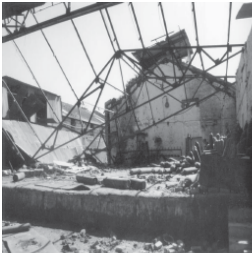
Photograph-1: Collapsed roof structure along with scattered intact cylinders.

Fortunately the fragment of exploded cylinder (Photograph-2) impacted only one empty cylinder near by and no other filled cylinder, or else the quantum of damage would have been quite higher than what had occurred.