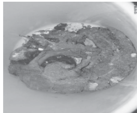
Photograph-3: Charred and separated remains stained with brownish granular material of victim-1( male aged 32 years) which were gathered in a yellow color tub-bucket.

Extremely mutilated, charred and separated remains weighing about 10 kg of a male –32 years, (Gathered in a yellow color tub-bucket) comprising of: (1) Scalp attached to some pieces of left side skull vault and facial skin attached to left half of mandible (with 8 teeth). (2) Piece of right mandible (with 7 teeth). (3) Five thoracic vertebra in one with attached pieces of ribs. (4) 15x10cm skin flap of anterior abdominal wall. (5) Two lumbar vertebra in one piece. (6) Three lumbar vertebra in one piece. (7) Acetabular fragment of right hip joint. (8) Acetabular fragment of left hip joint. (9) Fragment of right elbow joint. (10) Great toe (side not opened). (11) Unidentifiable soft tissue masses with bone remnants. (Photograph-3). All above stated materials were completely separated with each other and brownish granular material was sticking to uncharred areas.