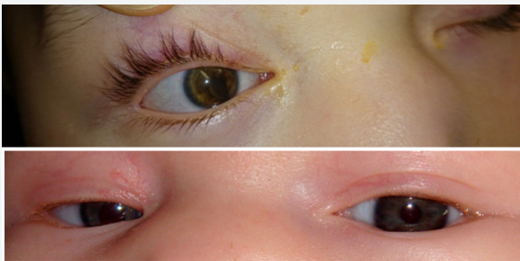
Figure 2: The patient's unilateral right-sided microphthalmia and right eye coloboma. Top) at 3 years of age showing clearly inferiorly oriented coloboma of the right eye. Bottom) at 6 month of age, showing normal left pupil.

minutes respectively and birth weight was 4.65kg. She required intubation, suctioning, and a brief stay in NICU due to meconium aspiration and was discharged home on day 1 of life. At 5 weeks of age, the infant presented to the emergency department with a 2-day history of afebrile infantile spasms. At this time, parents also inquired about the right eye coloboma and microphthalmia (Figure 2). She was admitted to hospital, and the diagnostic work-up included ophthalmologic assessment, EEG, and MRI. The pediatric ophthalmologist who saw this patient described unusual fundi with hyperpigmentation of the right optic disc with areas of nummular retinal pigment epithelial scars, and hyperopic error bilaterally. These findings are consistent with chorio retinal lacunae.