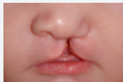
Figure 1: The patient's left-sided cleft lip and palate.

A female infant was born at 41 weeks gestation by induced vaginal delivery to a G1P0 28-year-old mother. The pregnancy was uncomplicated and parents are not consanguineous. Cleft lip was diagnosed prenatally on ultrasound at 29 weeks gestation. At birth, the baby was noted to have a cleft palate as well (Figure 1). Apgar scores were 3 and 8 at 5 and 10