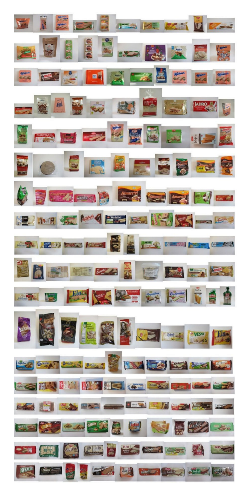
Figure A1. Pictures of all collected packages.