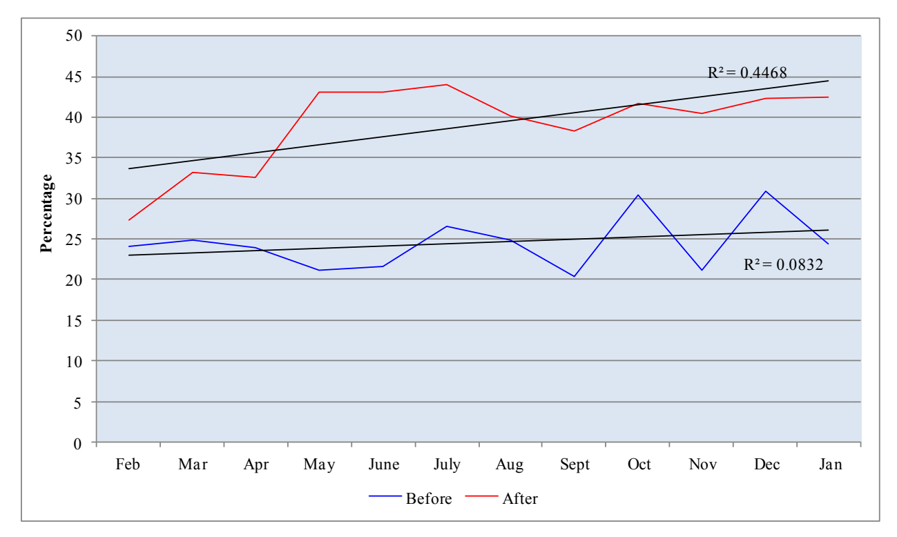
Figure 2: Trends of applications received for female children before and after implementation of the Majoni scheme

Cambodia, Turkey, South Africa, Indonesia and Côte d'Ivoire.<sup>20</sup> Evaluation results from the first generation of CCTs from Columbia, Mexico, and Nicaragua have shown that CCTs were successful in increasing school enrolment rates, improving preventive health care, and raising household food consumption.<sup>27</sup> In India, schemes with CCTs, such as the Janani Suraksha Yojana, have successfully achieved their aims of increasing institutional delivery.<sup>28</sup> The Majoni scheme was a