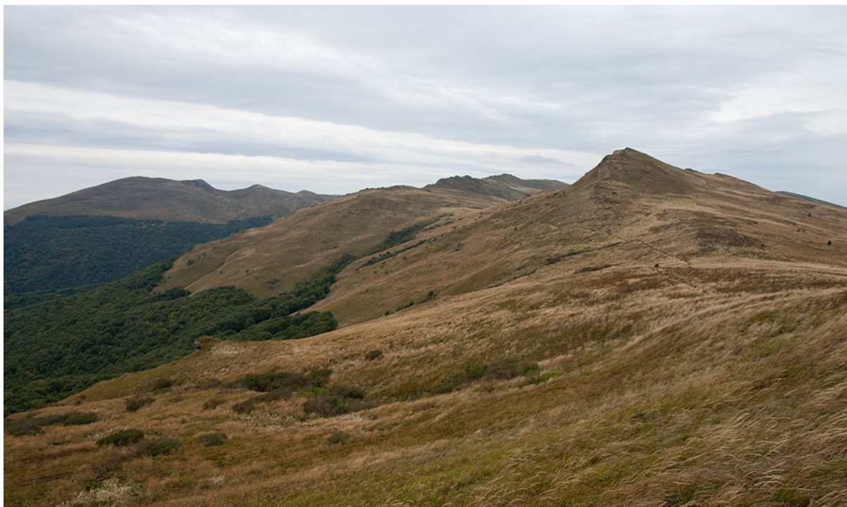
Fig. 5 Subalpine zone (polonynas) on Kopa Bukowa Mt, Bieszczady Mts (Sep 10, 2011).