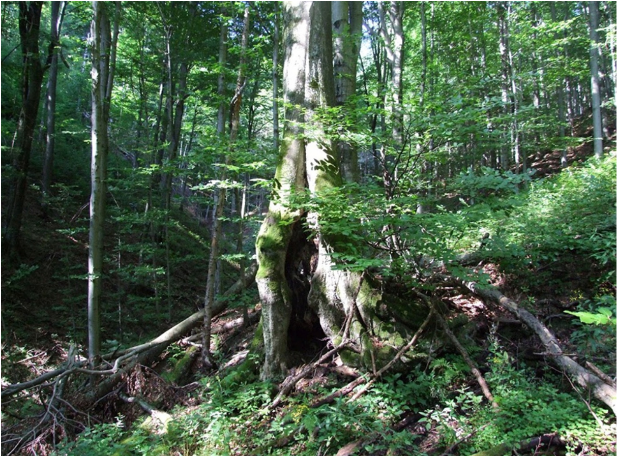
Fig. 2 Carpathian beech forest ( Dentario glandulosae-Fagetum ) on the slopes of the Otryt mountain range, Bieszczady Mts (Aug 16, 2009).