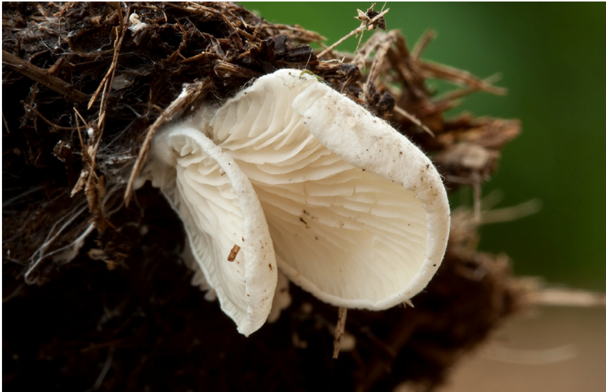
Fig. 9 Basidiomata of Clitopilus passeckerianus (Pilát) Singer from the Bieszczady Mts (Aug 1, 2011).