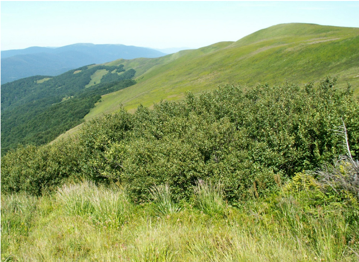
Fig. 4 Green alder ( Alnus viridis ) shrubs near Tarnica Mt, Bieszczady Mts (Jul 17, 2006).

feature for the Bieszczady Mts are the shrub communities with green alder (Fig. 4), Athyrio distentifoliae-Sorbetum alnetosum viridae , Pulmonario filarszkyanae-Alnetum viridis , Calamagrostis-Alnus viridis , or Salix silesiaca-Alnus viridis in subalpine areas. Hornbeam forests are rare and represented only by Tilio-Carpinetum ; additionally, common alder communities are extremely rare. The nonforest plant communities in the Bieszczady Mts were strongly influenced by the pasturage of sheep, goats, and horses in the past. Shepherding has resulted in the formation of unique landforms in the subalpine zone (above 1,200 m a.s.l.), called polonynas (Polish: poloniny ; Fig. 5), which are characteristic of the Eastern Beskidy Mts. Over 40 plant communities have been described in the subalpine zone of the Polish Bieszczady Mts. In the lower montane zone, over 50 types of nonforest plant communities are present. Of these, raised bogs ( Oxycocco-Sphagneteta ; Fig. 6), poor fens ( Scheuchzerio-Caricetea ), and poor meadows with Nardus stricta are the most valuable [3,5].