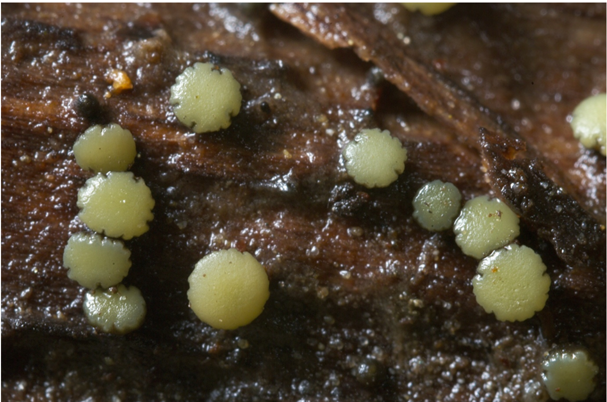
Fig. 14 Ascomata of Vibrissea decolorans (Saut.) A. Sánchez & Korf (Jun 3, 2010).