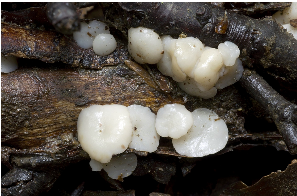
Fig. 10 Ascomata of Cudoniella tenuispora (Cooke & Massee) Dennis from the Bieszczady Mts (Jun 2, 2015).