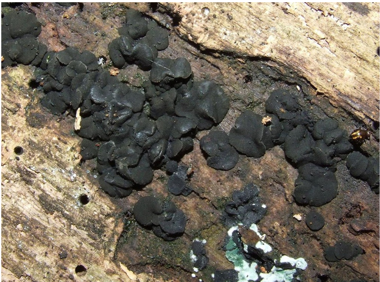
Fig. 8 Ascomata of Bulgariella pulla (Fr.) P. Karst. from the Bieszczady Mts (Aug 8, 2009).