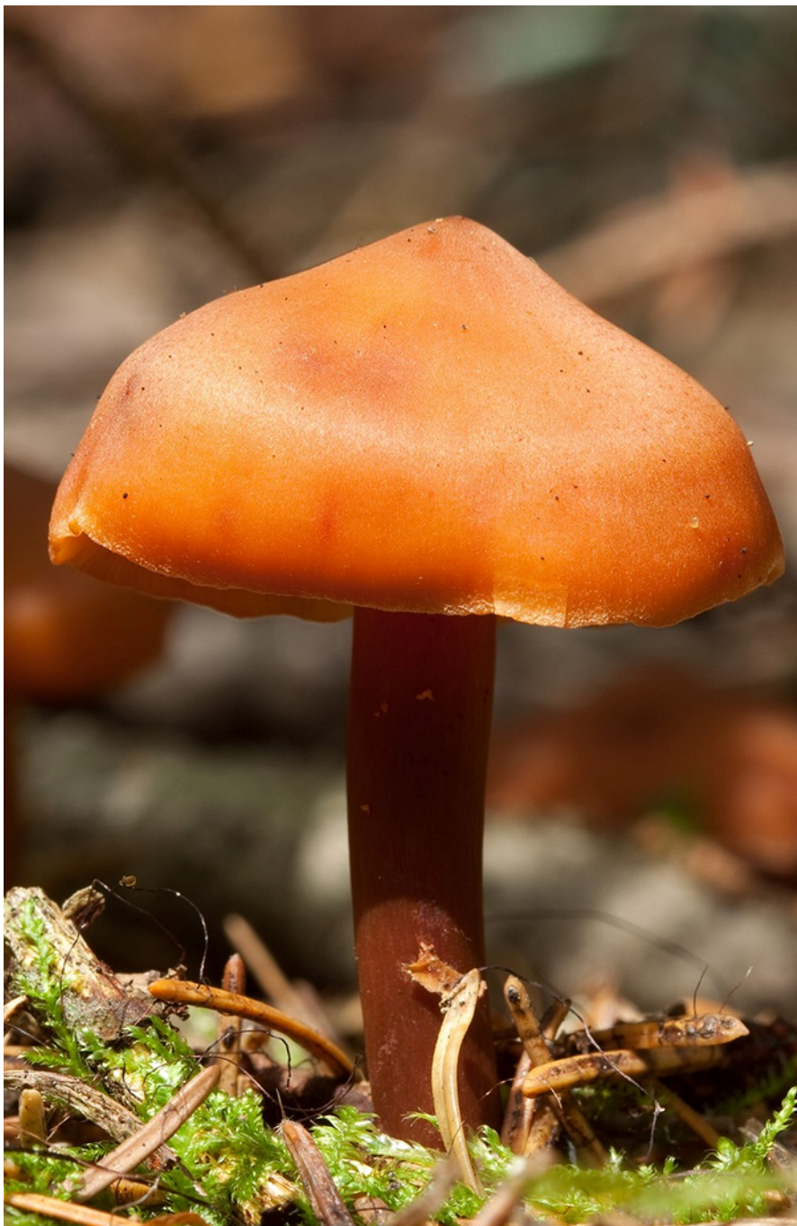
Fig. 12 Basidioma of Phaeocollybia jennyae (P. Karst.) Romagn. from the Bieszczady Mts (Aug 2, 2011).

valuable findings, as many fungal groups (genera Russula and Cortinarius , corticioid and hypogeous fungi, small Ascomycota) are still undercollected and underrepresented on the current species lists. Moreover, although field work has been conducted throughout the Bieszczady Mts, the greatest emphasis has been placed on the study of the Bieszczady National Park mycobiota. In consequence, the northern and western parts of the Bieszczady Mts have only been cursorily studied. Analysis of data on the Poloniny NP has showed that 462 species of macrofungi known from the Slovakian part of the Eastern Carpathians have not been observed yet in the Bieszczady Mts. Some of these, for example fungi inhabiting old oak trees and logs (e.g., Buglossoporus quercinus ), are unlikely to be collected in the Bieszczady Mts due to the absence of suitable habitats and substratum; however, most of these 462 taxa probably also grow on the Polish side of the border. Almost 1,840 macrofungi taxa are known from the Polish and Slovakian parts of the East Carpathian Biosphere Reserve.