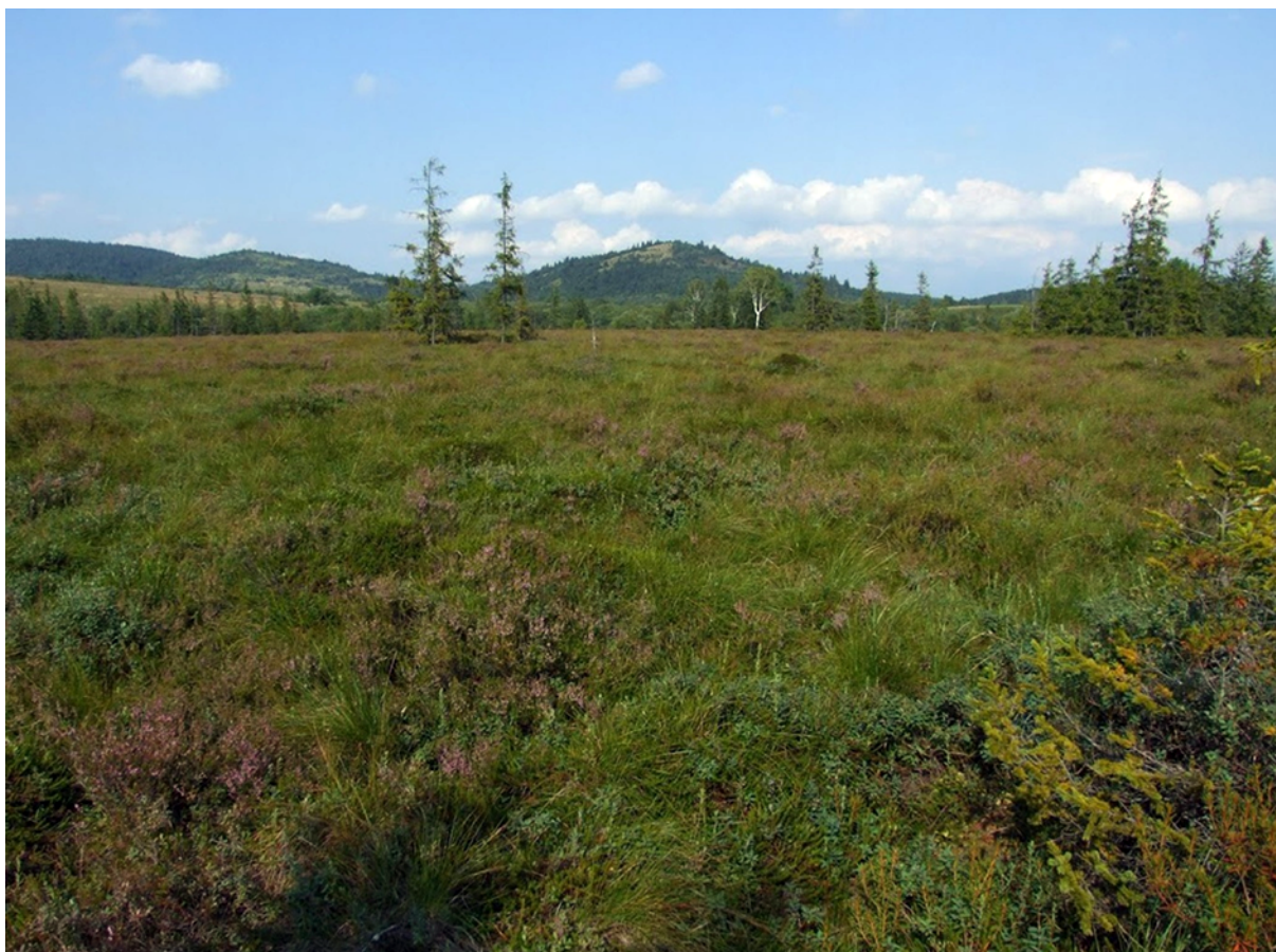
Fig. 6 Raised bog "Dzwiniacz" in the upper San valley, Bieszczady Mts (Aug 18, 2009).