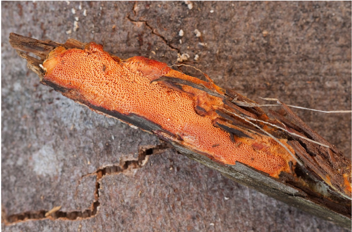
Fig. 7 Basidiomata of Auriporia aurulenta A. David, Tortič & Jelič from the Bieszczady Mts (Sep 5, 2011).