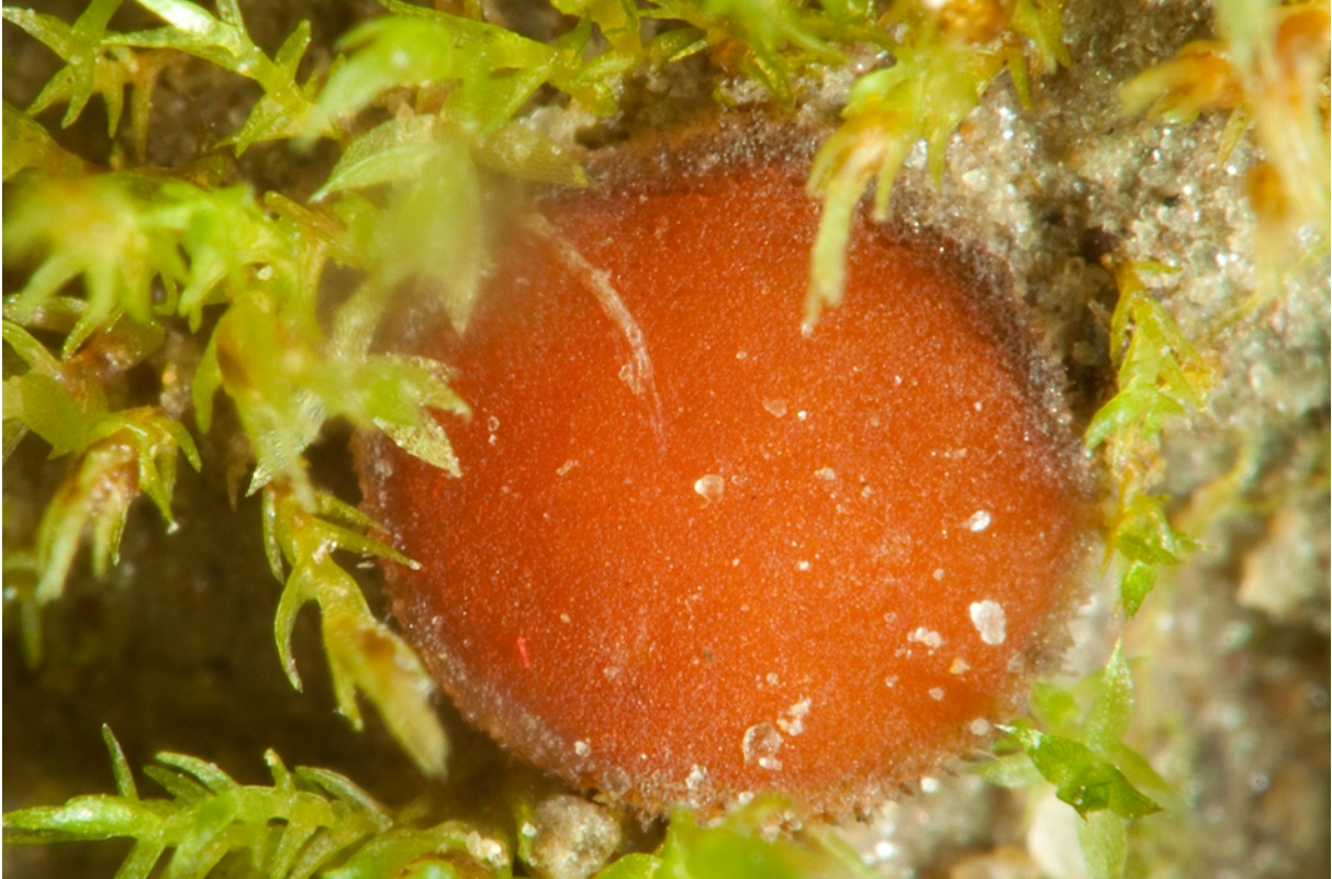
Fig. 13 Ascoma of Scutellinia torrentis (Rehm) T. Schumach. from the Bieszczady Mts (Aug 2, 2011).