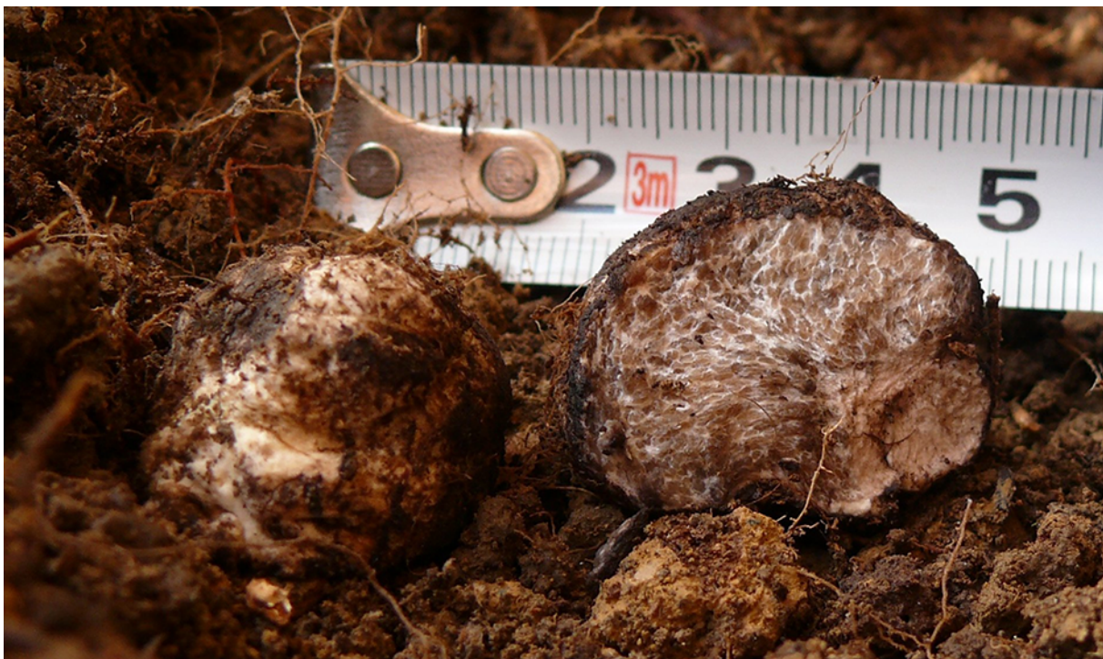
Fig. 11 Basidiomata of Octavianina mutabilis E. Bommer & M. Rousseau from the Bieszczady Mts (Nov 29, 2011).