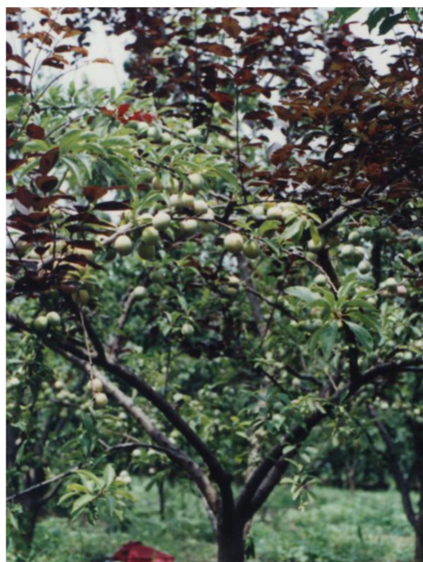
Figure 1. Scions of purple-leaved plum were grafted onto the crown of Yuhuang plum tree.

To confirm the observation by Burbank, we grafted 57 scions (twigs) from an adult purple-leaved plum tree ( Prunus cerasifera cv. Pissardii ) onto the crown of a 6-year-old Yuhuang plum tree ( Prunus salicina Lindl) in March 1998 (Figure 1).