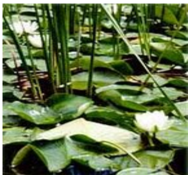
Fig. 4: Aquatic macrophytes

Aquatic multicellular macrophytes: Aquatic multicellular macrophytes (Fig. 4) include macroalgae (the green algae in the family Characeae), non-vascular plants (e.g., mosses), or vascular plants (the flowering plants). Aquatic macrophytes are water vegetations comprising macro algae and the true angiosperms. Aquatic macrophytes may be classified as emergent (e.g., cattails), free-floating (e.g., water lilies), or submerged macrophytes. Aquatic weeds are those undesirable plants, which reproduce and grow in water. When in excess, they choke the pond, creating problems for fish culture. Seaweeds and aquatic vegetation are such plants, which are pests to fish. The Monera are also discussed here as plant pests to fish. They are single celled, motile or non-motile organisms. Organisms are microscopic. Cell structure is simple with no definite nucleus. Aquatic algae make up this group.