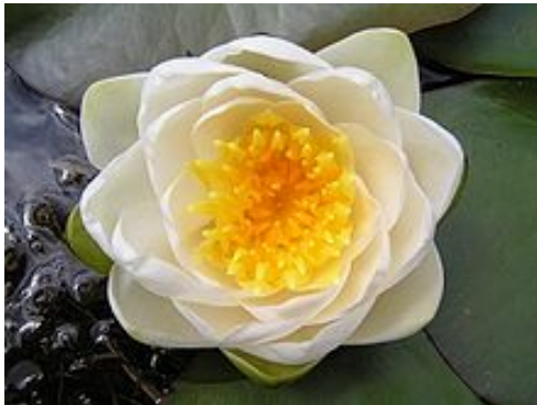
Fig. 1: Nymphaea alba , a species of water lily

composition of the phytoplankton are used to assess the biological integrity of the water body (Townsend et al. , 2000). Phytoplankton also reflects the nutrient status of the environment. They do not have control over their movements thus they cannot escape pollution in the environment. Barnes (1980) reported that pollution affects the distribution, standing crop and chlorophyll II concentration of phytoplankton. The abundance or periphyton also increases with increase in nutrient content. Periphyton can be an important source of food for herbivores. A review of the classification, distribution, control and economic importance of aquatic plants provides fish culturist information on some future challenges in culture fisheries management and practices.