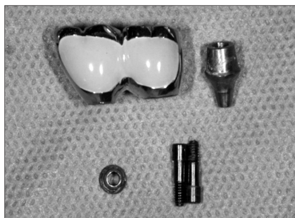
Fig. 2. Removed prosthesis and fractured abutment.