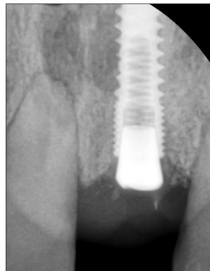
Fig. 7. Radiograph of root apex of fractured ceramic abutment.