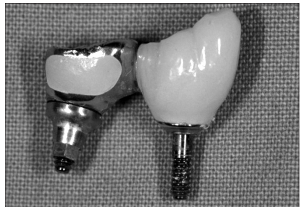
Fig. 4. Removed prosthesis and abutment.

The Case 2 is related to implant cement-retained-type prosthesis of a 48-year-old male patient who had 2 D5.0 mm×H10.0 mm internal connection-type implants placed for restoration. The patient visited the hospital complaining of mobility of prosthesis that occurred a few months ago in the right lower molar area. He was using 2 cement-retained-type prostheses using cement-retained-type abutment manufactured 4 years ago, and he visited the hospital due to the continuous mobility of the prosthesis without being examined for 3 years. For antagonistic teeth, removable partial denture was used, but it was manufactured to restore the lost molar in the left molar area. The antagonistic teeth of #46, 47 teeth were the #16, 17 removable partial