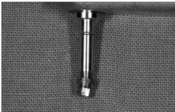
Fig. 6. Removal of fractured abutment using an exclusive tool.

When manufacturing prosthesis, first, for the aesthetic restoration of prosthesis, cement was placed at the top of abutment using zirconia abutment provided by the manufacturer. However, fracture occurred at the abutment in the lower part of the prosthesis. As shown in Figs. 7 and 8, the location of the fracture is 1/3 from the center of abutment. In this case, implantation was done by placing ceramic on the non-hex-type zirconia abutment; therefore, internal flaw caused by the repeated placement of ceramic and heat treatment