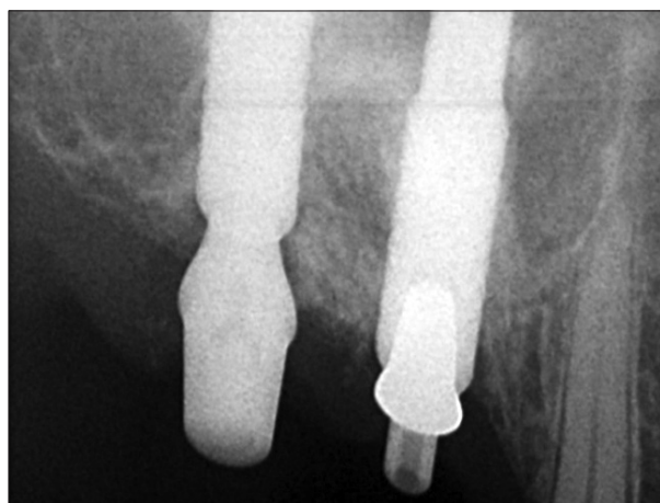
Fig. 1. Radiograph of root apex after removing prosthesis.

Mobility of prosthesis was detected, and the abutment screw in the screw retaining area was removed using torque wrench to remove the prosthesis accordingly. But there was a defect in the structure of the upper prosthesis as shown in Fig. 1, a radiograph of the root apex, and Figs. 2 and 3,