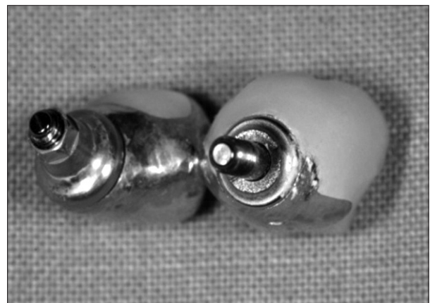
Fig. 5. Removed prosthesis and lower part of abutment.