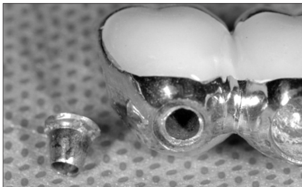
Fig. 3. Fractured abutment and lower part of prosthesis.

The separated lower structure of the UCLA abutment was removed including the posterior cement-retained-type abutment, and prosthesis was manufactured again by collecting impression implant from fastener level. The posterior abutment was changed to the hex type, and conformity of the prosthesis was checked thoroughly to connect 'passive fit' prosthesis that does not deliver excessive loading to the abutment.