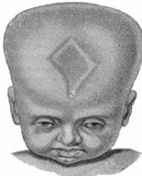
Figure 11 Rickets.