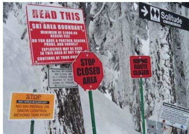
Figure 3. Picture of the warning signs passed by the group of skiers.

Notably, this visual depiction of the scene is supplemented with a textual description of the scene that contains the same information: