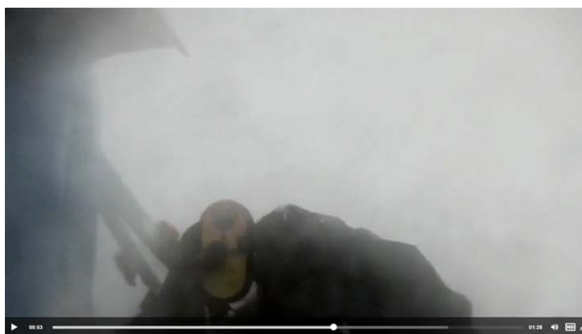
Figure 6. Still from the video " Is that a ski pole? "

Virtually experiencing the actual avalanche and its aftermath is enhanced by videos made by the helmet cameras of skiers at the time of the avalanche. An example is shown in Figure 6.