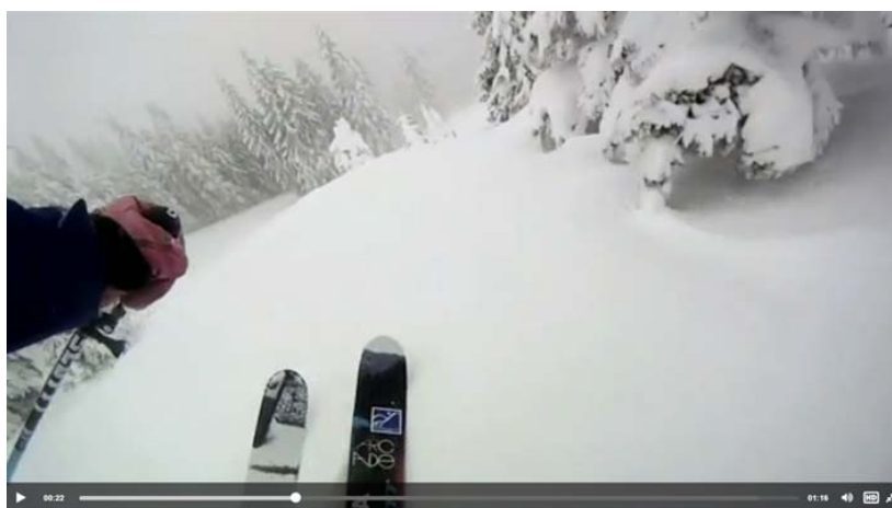
Figure 5. Still from the video Allure of the Backcountry .

Adopting such an internal viewpoint is also facilitated by videos. The video Allure of the Backcountry shows a skier alternately from an external viewpoint (see Figure 2 above) and an internal viewpoint. Figure 5 shows the internal viewpoint.