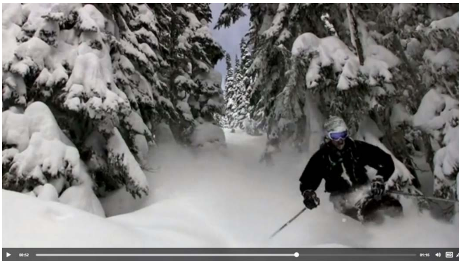
Figure 2. Still from the video Allure of the Backcountry .

The textual description of Tunnel Creek is accompanied by a video entitled Allure of the Backcountry (see Figure 2). The video shows the area, as well as a skier skiing Tunnel Creek, thereby enriching the reader's mental image of the story's setting.