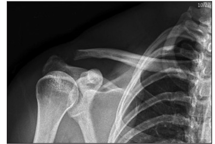
Figure 4: Postoperative Zanca radiograph showing adequate decompression of the acromioclavicular joint.

It is important to distinguish DCO from AC joint arthritis, and outcomes can differ following operative injury between the 2 conditions. Distal clavicle osteolysis can be diagnosed when pathologic changes such as sclerosis, reactive bone formation, and subchondral cysts are isolated to the distal clavicle only. A majority of studies examining outcomes following distal clavicle do not distinguish between pa-