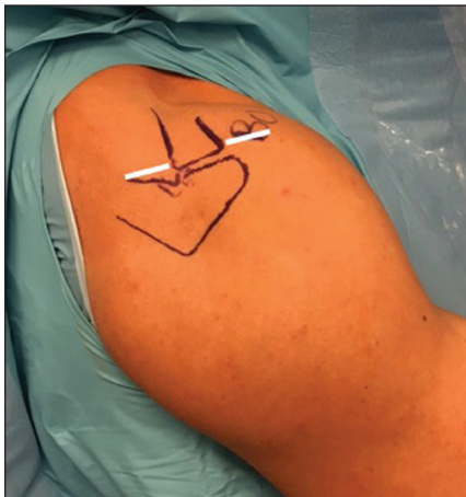
Figure 2: Preoperative photograph showing the landmarks drawn on the shoulder including the acromion, acromioclavicular joint, distal clavicle, and anterior and posterior portals (white lines are parallel to the acromioclavicular joint).