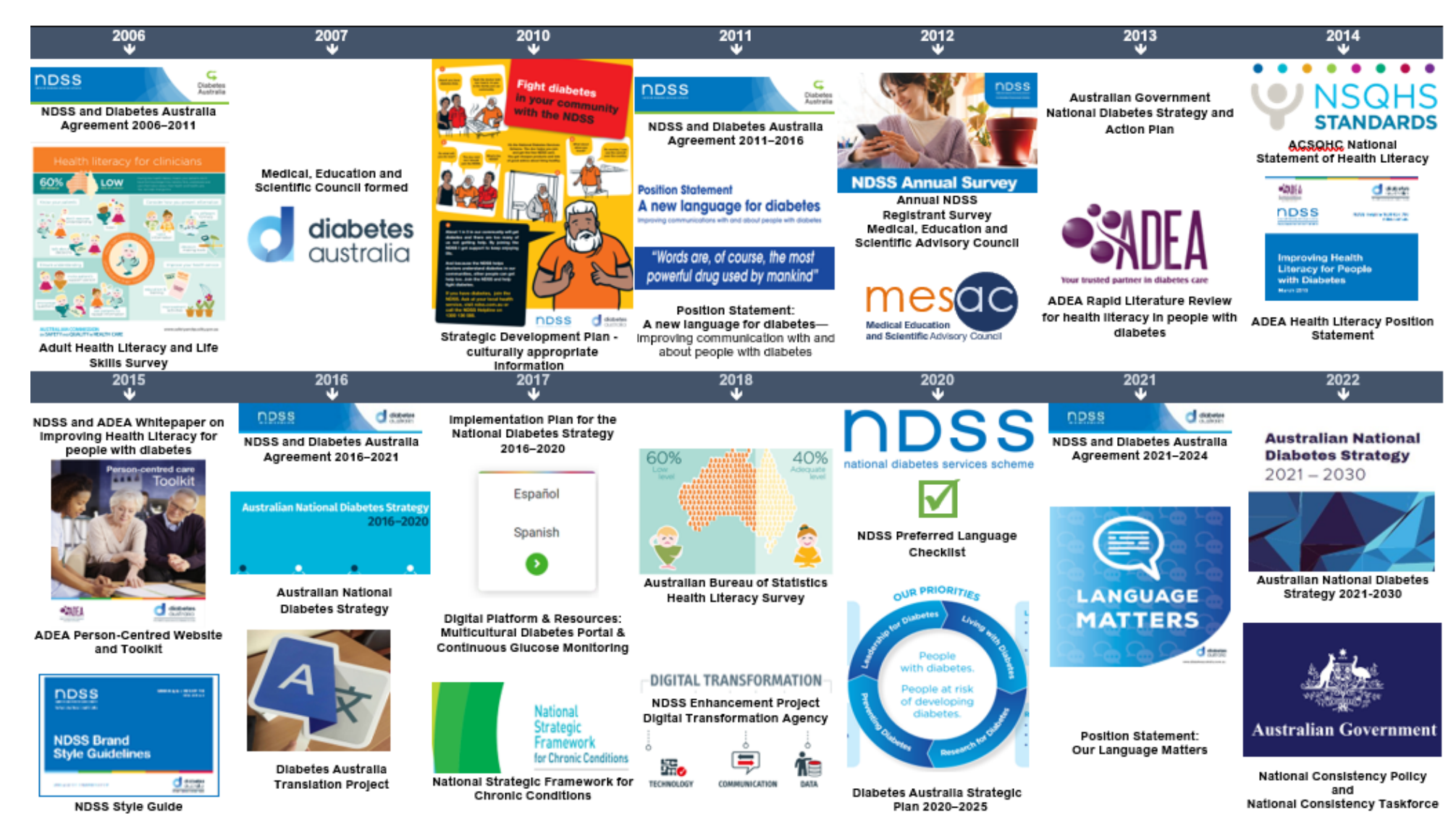
Figure 2. Key diabetes policy and position statements impacting health literacy practice change.