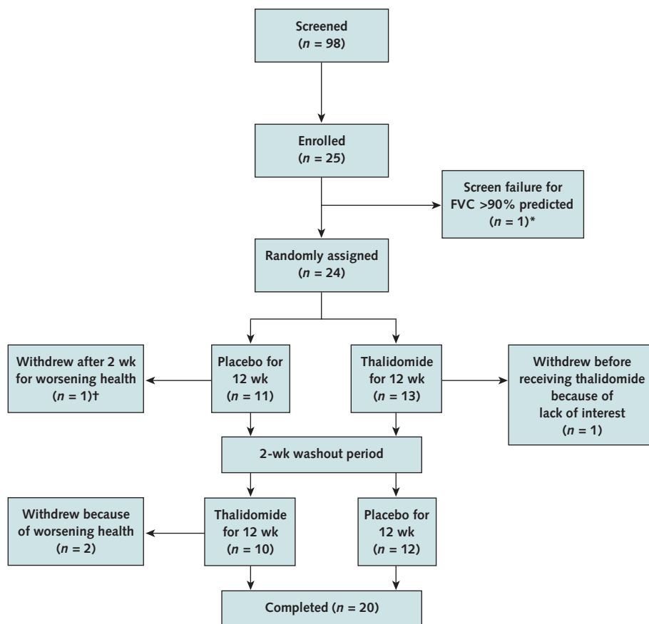
Figure 1. Study flow diagram.

We collected data for all planned study visits from 20 participants and incomplete data on 3 participants who received placebo first but withdrew before completion of the thalidomide group. Analysis included all available data.