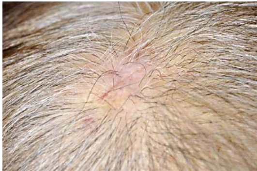
Fig. 1. A skin-colored nodule with surgery scar, telangiectasia and purpura on the scalp.

In conclusion, the combination of docetaxel with bisphosphonate was effective for MMP-9-expressing angiosarcoma and resulted in complete remission after the standard therapy for angiosarcoma. Further study is needed to confirm this limited observation.