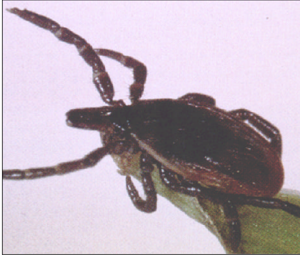
Figure 3. Adult deer tick.

The Feulgen reaction is DNA-specific (15); therefore, it appeared illogical that inclusions of an RNA virus would be specifically stained in our microscopy-based assay. Experimental evidence suggests, however, that glycoproteins may also be stained (16,17) in what is known as the plasmalogen reaction. The inclusions detected in tick salivary glands may, therefore, represent envelope proteins from massively replicating virus.