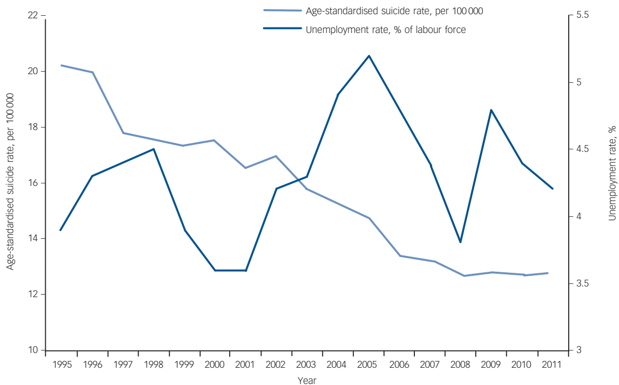
Fig. DS1 Age-standardised suicide rate (per 100 000) and the unemployment rate (% of the labour force) in Austria between 1995 and 2011.

10 National Centre for Health Statistics. Deaths: Final Data for 2010. National Vital Statistics Report, 2012. National Centre for Health Statistics, 2012.