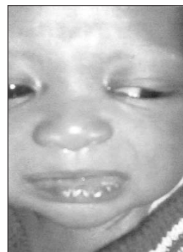
Fig. 1: Full face with slight mandibular retrognathism.

Examination revealed a healthy looking boy with slight mandibular retrognathism (Fig.1) but no other abnormality.