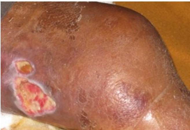
Fig. 1- Wound with Purulent Discharge

The patient did not give any history of diabetes mellitus, hypertension, HIV, tuberculosis or bronchial asthma. He was treated symptomatically with intramuscular NSAIDs. Three days later he became febrile and swelling of the knee gradually progressed superficially resulting in cellulitis of supra patellar region. He was put on broad spectrum antibiotics empirically. Later on an ill defined ulcer with irregular margin developed on lateral side of left knee associated with purulent discharge [Fig. 1].