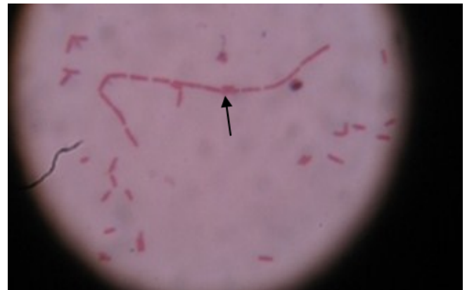
Fig. 3- Grams staining of Liquid Media showing Symplasmata