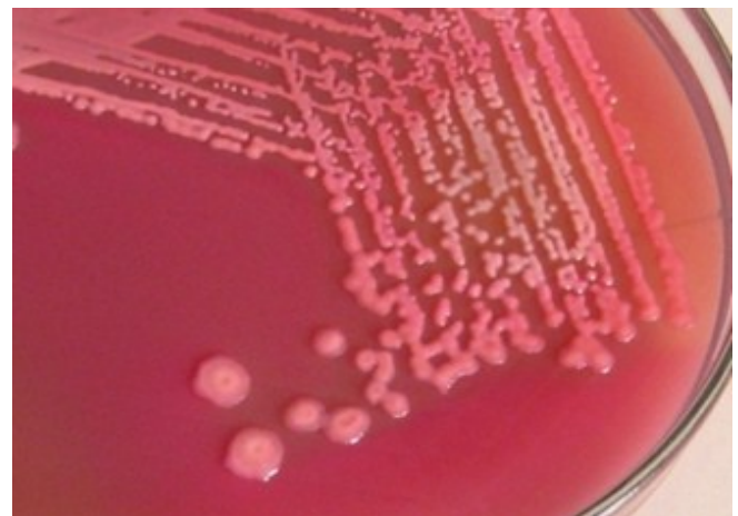
Fig. 4- Lactose Fermenting Colonies on MacConkeys Agar

Antibiotic susceptibility was done by Kirby-Bauer disc diffusion methods and it showed resistance to Amikacin, Gentamicin, Co-