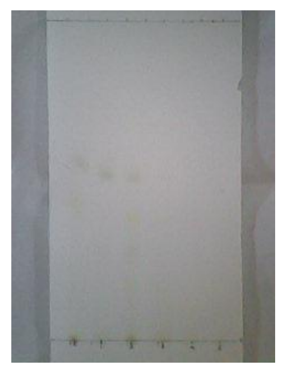
Plate 3. Chromatogram of column fractions in hexane/ethyl acetate before spray.