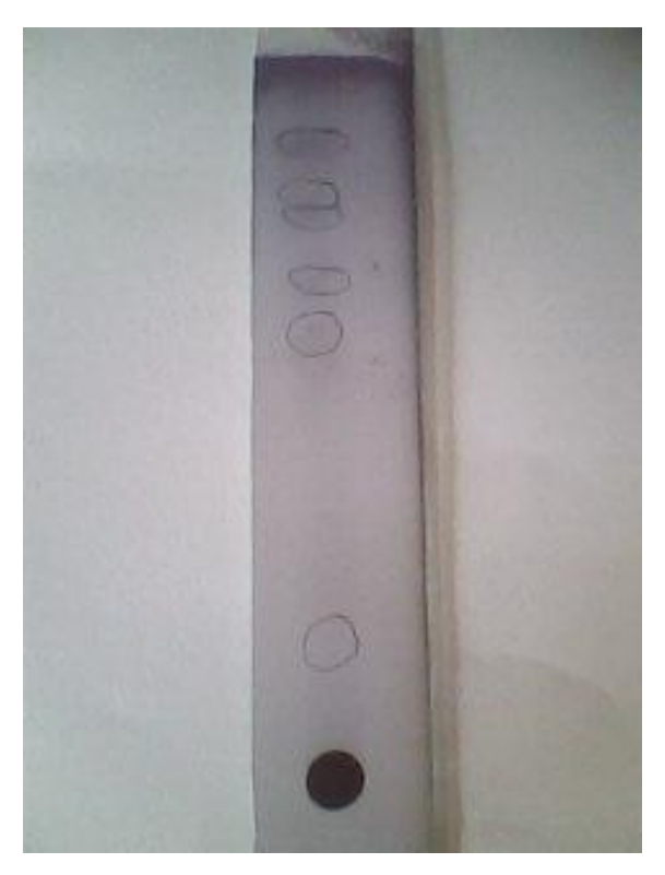
Plate 2. Chromatogram of methanol extract developed in hexane/ethyl acetate (8:2) after sprayed with 20% sulphuric acid and heated at 105°C for 15 min.