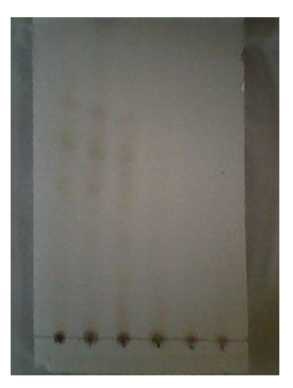
Plate 4. Chromatogram of column fractions in hexane/ethyl acetate (8:2) after spray with 20% sulphuric acid and heated at 105°C for 15 min.