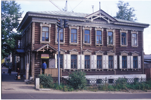
Fig. 39. Chita. G.S. Kitaevich house, Chkalov Street 83. Photograph: William Brumfield (9/14/2000)