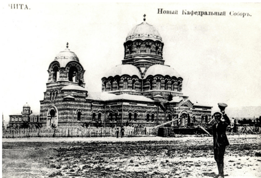
Fig. 29. Chita. Cathedral of St. Alexander Nevskii. South view. Early 20th-century postcard