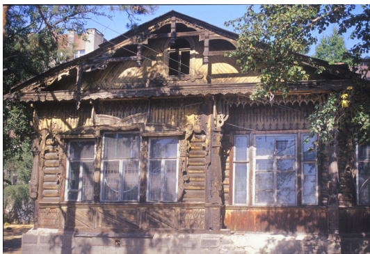
Fig. 37. Chita. S.A. Shilling house, Podgorbunskii Street 40. Side façade, window. Photograph: William Brumfield (9/14/2000)

that seem so distinctively Siberian. 76 One of the largest examples is the S. A. Shilling house, with its asymmetrical facade and florid window surrounds (Fig. 36, 37). One might call this style “frontier moderne .” Yet as the current condition of the Shilling house demonstrates, few of these houses are properly maintained. Indeed, most of them are under threat as the city gradually rebuilds itself and land prices increase for centrally located sites. As elsewhere in Siberia and the Russian north, these houses were of log construction, usually clad with milled siding, such as the A.V. Polutov house (Fig. 38). In some cases, exemplified by the G.S. Kitaevich building, log dwellings were designed for multiple apartments or rooms to meet housing needs for the town’s significant transient population (Fig. 39).