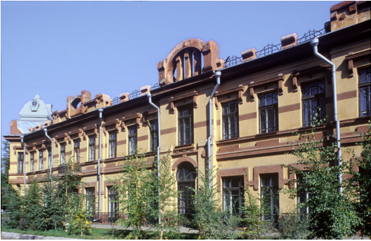
Fig. 20. Chita. Zazovskii Building, Anokhin Street 56. (9/14/2000)