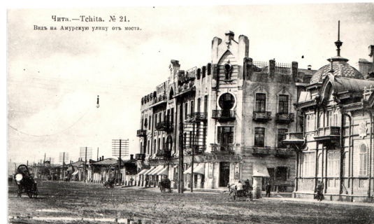
Fig. 13. Chita. View of Amur Street with Hotel Dauria. Early 20th-century postcard

Although most of the streets of Chita were renamed in the Soviet era, the central part of the city retains a grid plan extending to the north of the railroad, which runs parallel to the west-east course of the Chita River. The drawback to this arrangement is the railroad's separation of the central district from the river (Irkutsk and Krasnoiarsk are more fortunate in this regard), but the railroad was clearly the town's dominant presence, and the street pattern reflects this. The original station building, constructed in 1899-1903, was symmetrical in design and middling in size, with Beaux Arts and classicizing details (Fig. 14).