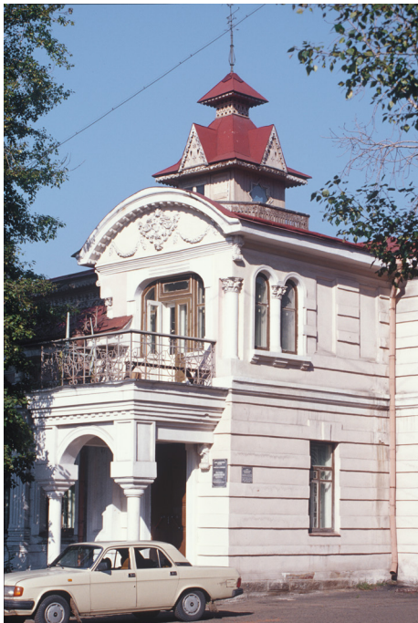
Fig. 44. Chita. Nikitin house. Photograph: William Brumfield (9/14/2000)

have provided at the time of its construction a sweeping panorama of dusty Chita.