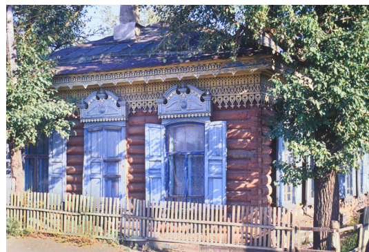
Fig. 9. Nerchinsk. Wooden house, Soviet Street 22. Photograph: William Brumfield (9/12/2000)