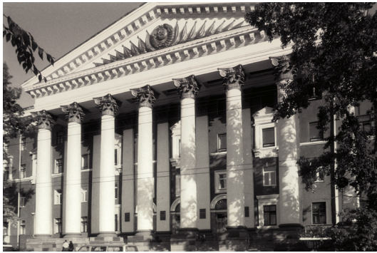
Fig. 46. Chita. Headquarters of TransBaikal Railroad. Photograph: William Brumfield (9/14/2000)