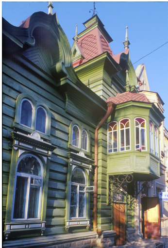
Fig. 35. Chita. M.D. Ignat'eva house, Anokhin Street 53. Photograph: William Brumfield (9/14/2000)