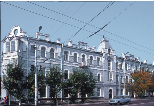
Fig. 21. Chita. Dmitrii V. Polutov Building, Butin Street 39. Photograph: William Brumfield (9/14/2000)

wealthy Siberian entrepreneur whose fortune was based on trade and gold mining. Located on Cathedral Square across from the main Chita post office, the original part of the Polutov building was completed in 1908, with an expansion to its current size (Fig. 21) in 1914. A subsequent building belonging to Aleksandr V. Polutov (1910; Fig. 22) was designed by Fedor Ponomarev with a more elegant combination of style moderne with Beaux Arts detail.