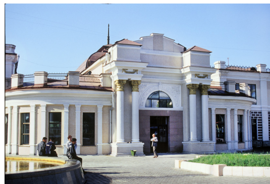
Fig. 14. Chita. Railway Station. (9/14/2000)