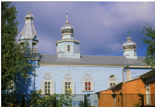
Fig. 30. Chita. Church of the Resurrection. (9/14/2000)

transportation and construction, serves as a base for ornamental window frames and cornices. Metal cupolas arise not only above the main worship space but also over the bell tower, the vestibule, and the entrance porch. A curious, but no less effective decorative element is provided by the large crossed beams that support the porch roof – an approach suggestive of Asian temple architecture.