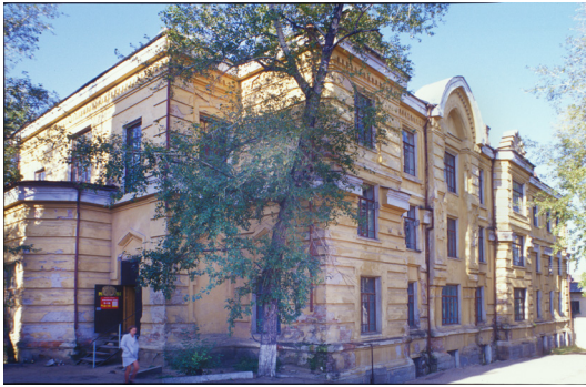
Fig. 32. Chita. Synagogue. Northeast view. (9/14/2000)