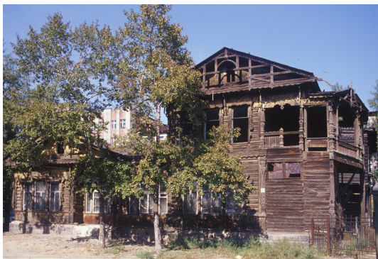
Fig. 36. Chita. S.A. Shilling house, Podgorbunskii Street 40. (9/14/2000)