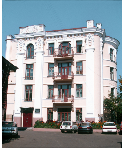
Fig. 22. Chita. Aleksandr V. Polutov Building, Lenin Street 100B. Photograph: William Brumfield (9/14/2000)

The most advanced, “rational” approach to commercial architecture in Chita appeared in the design for a department store and office building owned by the large Siberian retail firm of Vtorov. The patriarch of the family, Aleksandr Fedorovich Vtorov, began as a textile entrepreneur in the central Russian city of Kostroma, on the Volga