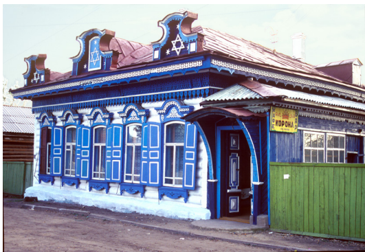
Fig. 11. Nerchinsk. Wooden house and store, Soviet Street 12.