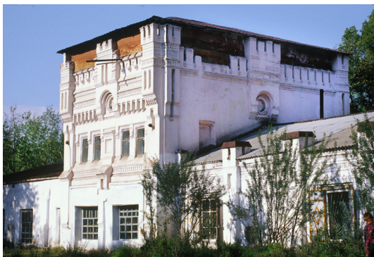
Fig. 5. Nerchinsk. Water tower and warehouse, M.D. Butin compound. Photograph: William Brumfield (9/12/2000)

Notwithstanding the eclectic, historicist style of the Butin compound, the center of Nerchinsk is suffused with a provincial neoclassical ambience that one might associate with certain regional towns of the United States in the middle of the nineteenth century. The defining component of the neoclassical ensemble is the Merchants' Court (see Fig. 3), overlooking Bazaar Square. Its columnated center is reflected in two other