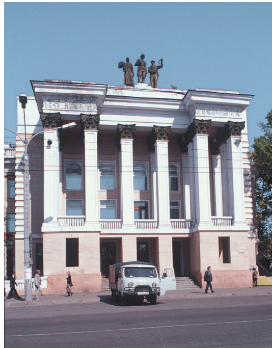
Fig. 45. Chita. Regional Building of Army Officers, Lenin Street. Photograph: William Brumfield (9/14/2000)

Space does not allow a summary of the tangled events that marked Semenov's brutal misrule. 79 The Bolshevik defeat and execution of Admiral Aleksandr Kolchak – Semenov's rival for power among White forces in Siberia – signaled the decline of the ataman's power, and during 1920 Semenov's forces were driven first from Chita and then from the entire Transbaikal area. New authority lay in the Far Eastern Republic, formed in Verkhneudinsk (now Ulan-Ude) in April 1920 and headquartered in Chita from November of