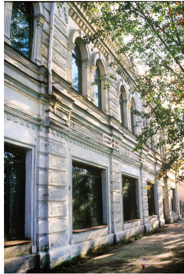
Fig. 7. Nerchinsk. Butin Department Store, Shilov Street 4. Photograph: William Brumfield (9/12/2000)

Although the waning of the tea trade had weakened the development of Nerchinsk, the town's location near a major river and the Trans-Siberian Railway sustained a modest level of prosperity evident not only at the Butin compound, but also in other substantial commercial buildings erected toward the end of the nineteenth century (Fig. 7). Nerchinsk also had attractive wooden houses, usually of one story, with elaborately ornamental window surrounds and cornices typical of Siberian architecture at the turn of the twentieth century (Fig. 8, 9, 10). 61 In some cases these dwellings are connected to a small store (Fig. 11). Nerchinsk is now a dusty provincial town with a declining population of less than 16,000; yet the historic core reminds of a century in which it witnessed Anton Chekhov, George