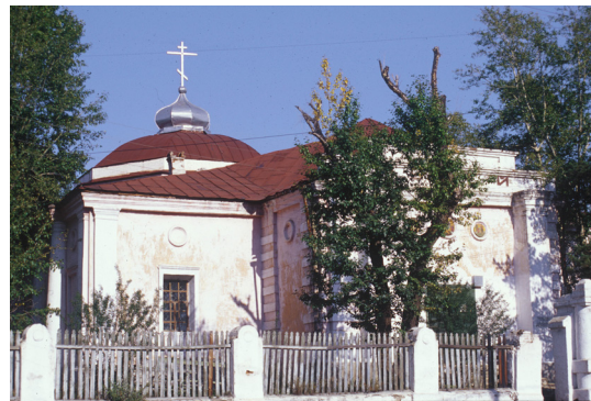
Fig. 2. Nerchinsk. Cathedral of the Resurrection. West view. (9/12/2000)

During the nineteenth century Nerchinsk endeavored to maintain a position as one of the main points for trade with the Orient. 31 This mercantile side of the town was visibly represented by its imposing Merchants' Court ( gostinyi dvor ), whose graceful neoclassical design possessed a sense of proportion lacking in the cathedral, which it faces on the same axis. The center of the Merchants' Court, completed in 1840, consists of a two-story building with an arcaded ground floor supporting a portico of six doric columns and a pediment (Fig. 3). The main structure is flanked on either side by low elongated extensions that were divided into a total of twenty stalls for commercial space. 32 These extensions originally had an arcade providing access to the trading stalls, and although the arcade has since been enclosed, its outlines are still visible on the facade. The main structure's evocation of a temple of commerce is a device that appeared in Merchants' courts throughout the Russian provinces, yet the Nerchinsk example shows more care in overall design as well as