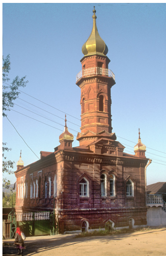
Fig. 33. Chita. Mosque, Anokhin Street 3. Photograph: William Brumfield (9/14/2000)