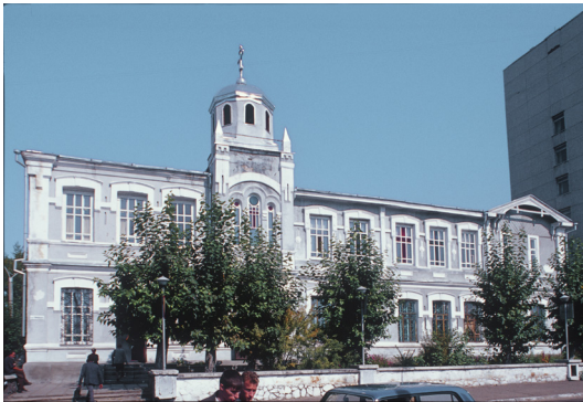
Fig. 27. Chita. Orthodox Missionary School, Butin Street 12.