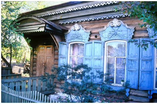
Fig. 10. Nerchinsk. Wooden house, May First Street 22. Photograph: William Brumfield (9/12/2000)