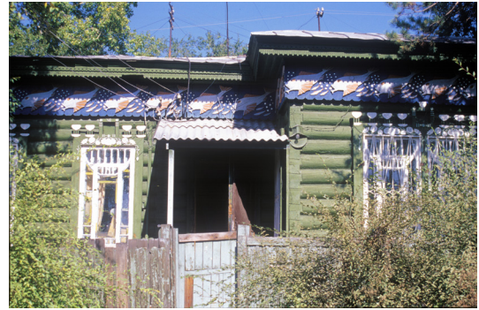
Fig. 41. Chita. M. Timokhovich house, Nagornaia Street 38. Photograph: William Brumfield (9/14/2000)