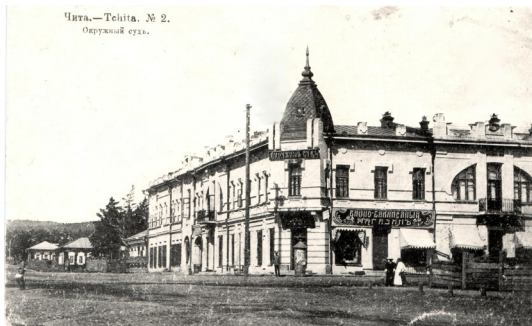
Fig. 24. Chita. Starnovskii Building. Early 20th-century postcard