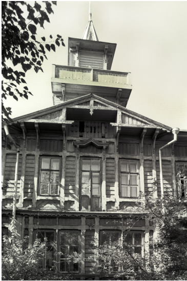
Fig. 26. Chita. Post Office and Telegraph Building. Photograph: William Brumfield (9/14/2000)