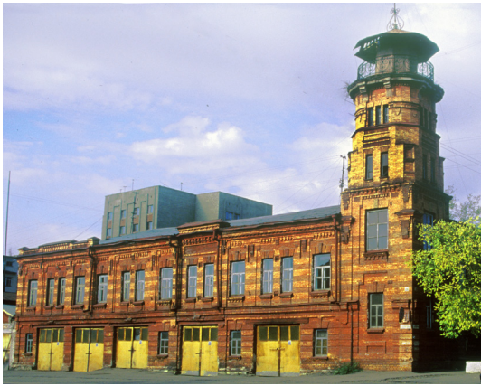
Fig. 43. Chita. Fire and Police Station, Chkalov Street 116. (9/14/2000)