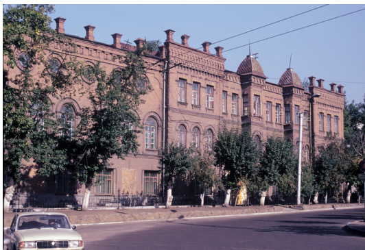
Fig. 25. Chita. Command Headquarters of Trans-Baikal Cossack Troops and General Office of the Amur Railway, Ataman Square. Photograph: William Brumfield (9/14/2000)

major urban level and is commensurate with the Vtorov firm's reputation as an economic force in Moscow, as well as in Russia generally.