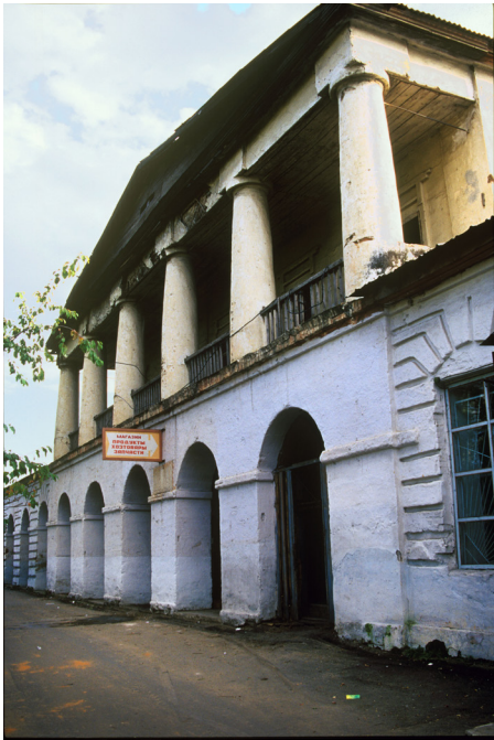
Fig. 3. Nerchinsk. Gostinyi dvor (Merchants' Court). (9/12/2000)

detail, particularly when compared with the Gostinyi dvor in Kiakhta.