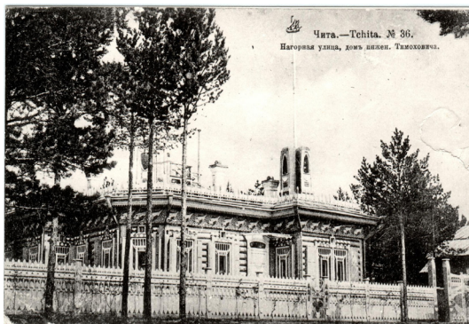
Fig. 40. Chita. M. Timokhovich house. Early 20th-century postcard