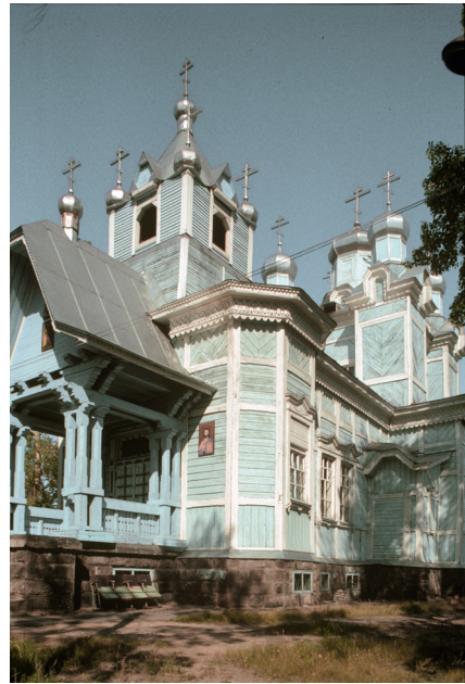
Fig. 31. Shilka. Church of Sts. Peter and Paul. Southwest view. (9/12/2000)

Despite the destruction visited upon Chita's Orthodox heritage, some churches in the area survived, such as the active Church of Saints Peter and Paul, built in 1904 at Shilka. Located some 250 kilometers to the east of Chita, the settlement was founded near the Shilka River in 1899 as a station on the Trans-Siberian Railroad. The Church of Saints Peter and Paul (Fig. 31) is one of the rare surviving examples of a standardized project for wooden churches adjacent to railroad stations in Siberia. Nicholas II took a special interest in the providing of churches (and, in this case, an adjoining parish house and priest's residence) for new communities not yet able to afford the expense of such buildings. The structure's milled siding, placed in prefabricated panels for ease of