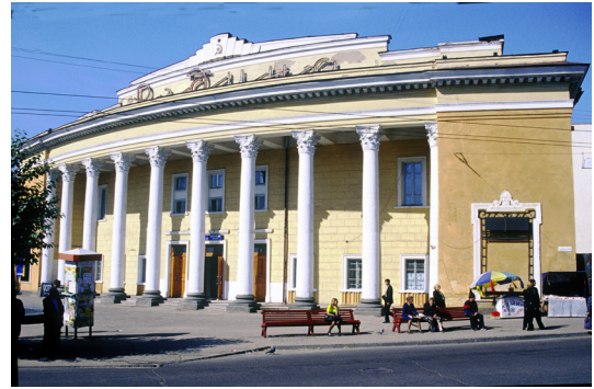
Fig. 47. "Rodina" Cinema, Chaikovskii Street 14. Photograph: William Brumfield (9/14/2000)

that year. Pro-Soviet in orientation, the republic served as a buffer to Japanese military operations in the Far East. Following the withdrawal of the Japanese, the Far Eastern Republic was merged into the newly formed Union of Soviet Socialist Republics in 1922.