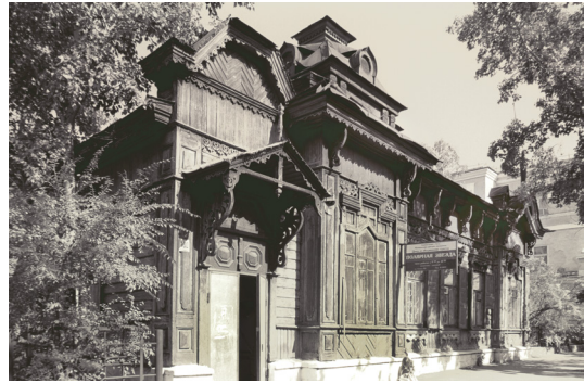
Fig. 38. Chita. Aleksandr V. Polutov house, Lenin Street 100. Photograph: William Brumfield (9/14/2000)