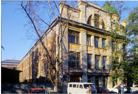
Fig. 23. Chita. Vtorov Building (Passage), Amur Street 56. Photograph: William Brumfield (9/14/2000)

proclaims the aesthetic values of modernity. This crisp, refined integration of structure and ornament suggests architectural design on a