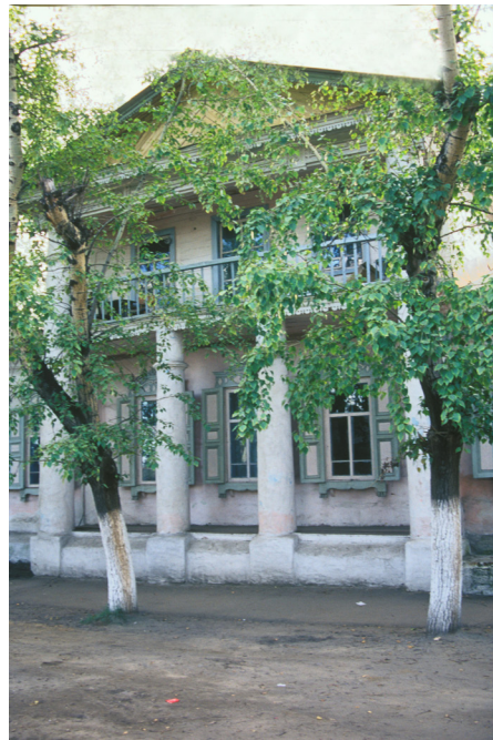
Fig. 6. Nerchinsk. Hotel Dauria. (9/12/2000)

buildings in the vicinity of the square: the Hotel Dauriia (Fig. 6) and the main pharmacy. Built during the second half of the nineteenth century, both the hotel and the pharmacy are essentially one-story structures with an elevated center (known in Russian as mezzonin). The pediment of the mezzonin rests on two Doric columns that frame a balcony supported by two smaller columns. This simple but effective transformation provides a grace note to the center of nineteenth-century Nerchinsk.