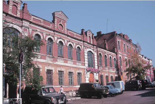
Fig. 18. Chita. A.E. Dukhoi Building, Nerchinsk Street 19.

architecture was generally called in Moscow and Saint Petersburg, are the Zazovskii Building (1909-11: Fig. 20) and a three-story building commissioned by Dmitrii V. Polutov, yet another