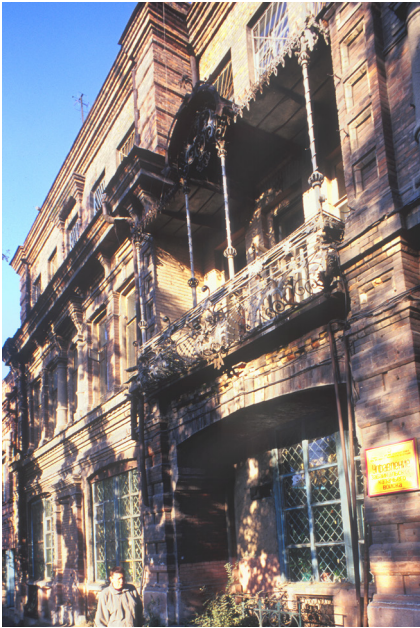
Fig. 17. Chita. B.V. Khlynovskii Building. Photograph: William Brumfield (9/14/2000)

1906-12 served as the Russo-Chinese Bank. The most distinctive feature of the Khlynovskii Building's facade was its twin cast-iron balconies (more accurately, loggias), with a dominant heraldic motif of eagle and dragons (Fig. 17). During the Soviet era the building's complex cornice was flattened and another story added, but the phantasmagoric ironwork still flanks a large central window, with its baroque pediment above the second story.