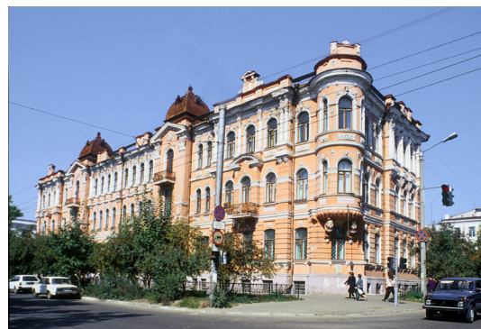
Fig. 16. Chita. Shumov Building, Lenin Street 84. Photograph: William Brumfield (9/14/2000)

As in Petersburg, these large buildings were usually surfaced with stucco, but some were designed to exploit the decorative properties of red brick. A good example of Chita’s “brick style” was the building constructed in 1902 for Vasilii Khlynovskii, who at the time served as mayor. Designed by Gavriil Nikitin, the building initially contained the Hotel Moskva, and from