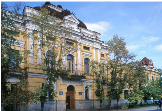
Fig. 28. Chita. First Women's High School, Chkalov Street 140. Photograph: William Brumfield (9/14/2000)

original purpose. The wide, two-story structure displays a panoply of ornament in the globe-spanning decorative style of late nineteenth-century wooden architecture.