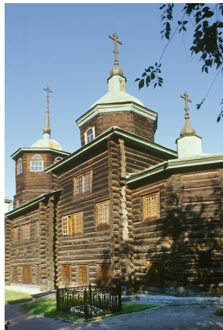
Fig. 12. Chita. Church of Archangel Michael. Southeast view.