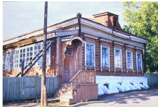
Fig. 8. Nerchinsk. Wooden house, Shilov Street 15. Photograph: William Brumfield (9/12/2000)