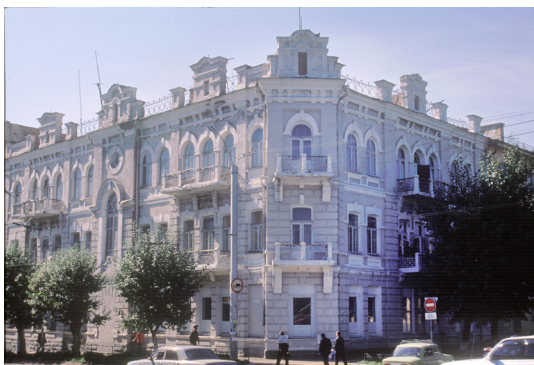
Fig. 15. Chita. K.I. Bulemakin building, Butin Street 22. Photograph: William Brumfield (9/14/2000)

This rapid growth was not without the turbulence that afflicted Russia generally at the beginning of the twentieth century. As has been noted, the Nerchinsk-Chita area had long been used as a place of exile, and with the development of the railroad, the area acquired a substantial number of skilled workers, many of whom were not sympathetically disposed to the existing political and economic order. Following a series of military failures in the Russo-Japanese War and triggered by the massacre of demonstrators in Saint Petersburg in January 1905 (“Bloody Sunday”), many areas of the country witnessed an outbreak of strikes and even armed rebellion. In Chita this uprising culminated in a short-lived “Chita Republic,” which lasted from December 1905 to January 22, 1906. After offering some concessions toward greater political and religious freedom, the tsarist regime used military force to restore authority throughout the country in the aftermath of this “First Russian Revolution.” In Siberia and the Far East the punitive campaign, including the execution of most of the leaders of the “Chita Republic,” 71 was supervised by Baron Alexander Meller-Zakomelskii and General Paul von Rennenkampf, the latter notable for his lack of military success in both the Russo-Japanese and First World Wars.