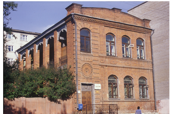
Fig. 42. Chita. A.D. Viazmin house, Chkalov Street 22. Photograph: William Brumfield (9/14/2000)

between the stout log walls and the marine elements is further emphasized by art nouveau decorative touches, particularly in the lotus motifs of the painted window surrounds (Fig. 41).