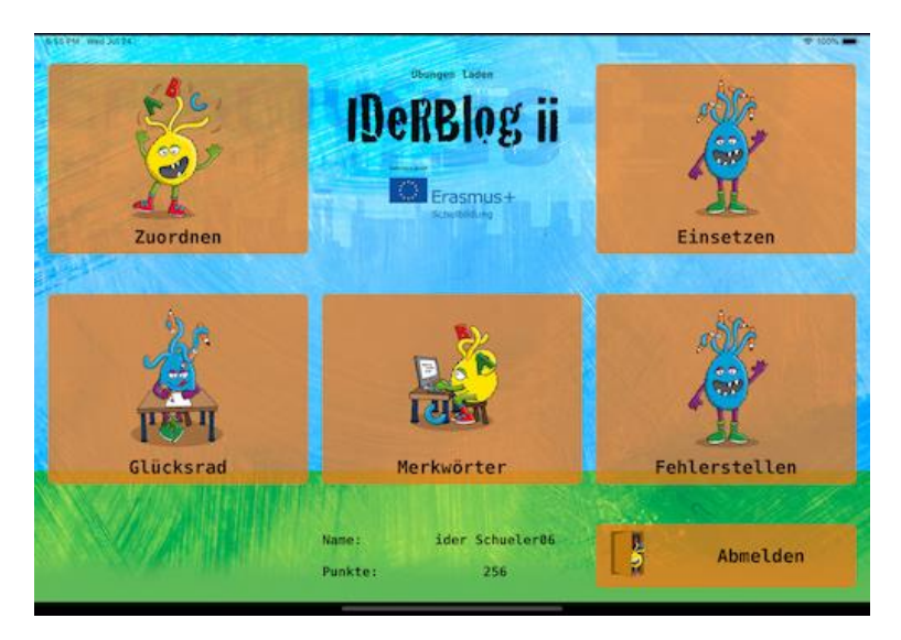
Fig. 2. Overview of the exercise formats

In the second exercise format (Fig. 2) in the lower left corner, which is called "Wheel of Fortune", pupils must type an auditioned word into an input field. The word can be auditioned as often as needed before it is entered. This exercise can be made more difficult by setting a timer that limits the time of input. If the word is entered correctly, it will be shown to the Student. Otherwise, the wrong input and the correct word will be displayed one below the other as feedback.