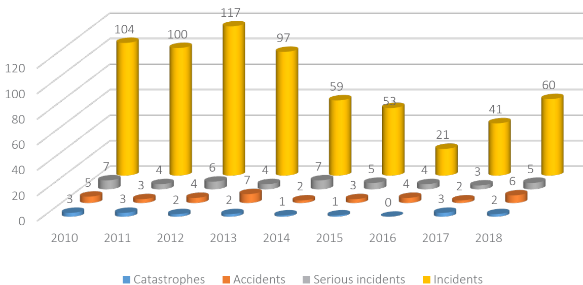
Figure 3. Dynamics of aviation cases in Ukraine during 2010–2018