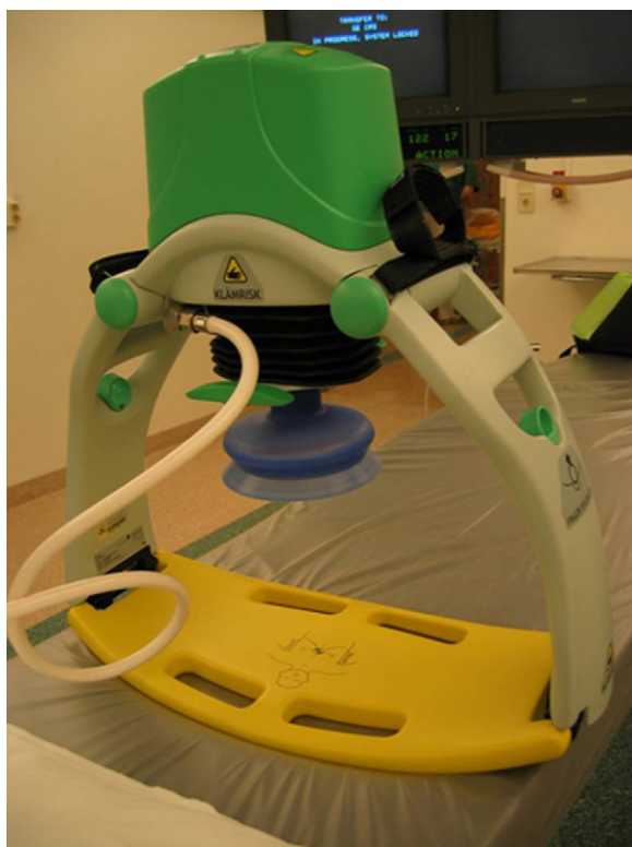
Fig. 1. Image of LUCAS™, Jolife AB, Lund, Sweden.

in cardiac arrest but with circulation maintained with mechanical chest compressions. 8 Our experience since 2004 with the chest compression device LUCAS™ is similar. Essentially, all patients admitted to our catheterisation laboratory already in cardiac arrest, but with circulation maintained through mechanical chest compressions, do not survive. However, patients who arrive at the catheterisation laboratory with intact circulation and who then suf-