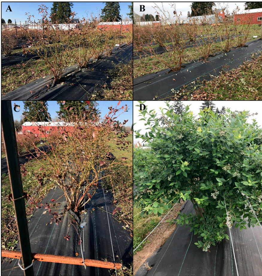
Fig. 1. ‘Legacy’ blueberry after pruning according to three methods. (A) Control: standard pruning for ‘Legacy’, removing less wood and leaving more short, thin laterals and a denser bush than is typical for most northern highbush cultivars. (B) HB: standard northern highbush style pruning. (C) V-trellis: control pruning with an additional set of trellis wires to allow for positioning of the canes in a V shape. (D) V-trellis plants in summer, showing the regrowth of shoots with fruit in the center of the canopy. (A–C) were taken 10 Feb. 2020; (D) 3 June 2020.

Averaged over all 4 years, HB-pruned plants had a lower yield (6.7 kg/plant) than control-pruned plants ( P = 0.0086 ), particularly those trained to a V-trellis (7.5 kg/plant). Typically, when more wood is removed at pruning, as with the HB method compared with the control, yield is lower (Seifker and Hancock, 1987; Strik et al., 2003). When analyzed by year, pruning method did not affect yield in 2018 or 2019 (Fig. 2). In 2020, control-pruned plants trained to a V-trellis had the highest yield (6.0 kg/plant), control-pruned with the standard trellis were intermediate (5.8 kg/plant), and HB-pruned with the standard trellis had the lowest (5.1 kg/plant) (Fig. 2). In 2021, control-pruned plants with a standard or a V-trellis (9.3 kg/plant) produced higher yield than HB-pruned plants (8.5 kg/plant) (Fig. 2). These yields are equivalent to 34.4 and 31.5 t·ha -1 for control and HB-pruned treatments, respectively. Similar yields are common in well-managed,