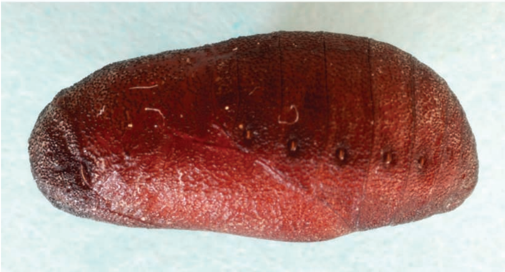
Figs. 4, 5, 6. Pupa of T. ballus .