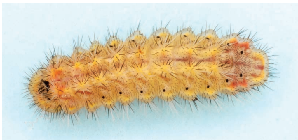
Fig. 2. Final stage larva of T. ballus with predominantly yellowish colours.

caterpillars. Figure 7 shows the orifices opening to the exterior corresponding to these two structures. In the middle of the 7 th abdominal segment, the transverse slit corresponding to the orifice of the opening of the Newcomer glandular complex may be seen. In the adjacent 8 th abdominal segment, just behind the last pair of respiratory stigma, the circular exit orifices for the tentacular pairs, which are off-white in colour, are visible.