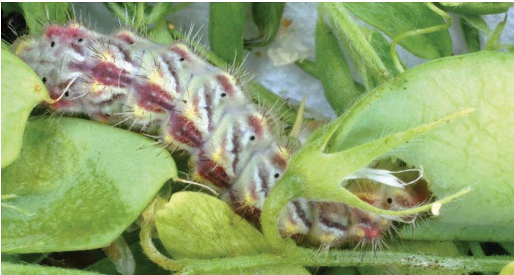
Fig. 9. Final stage larva of T. ballus feeding on a lentil legume.