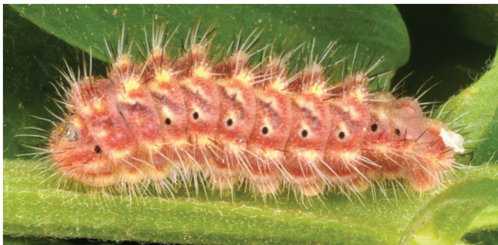
Fig. 3. Final stage larva of T. ballus with predominantly reddish colours.