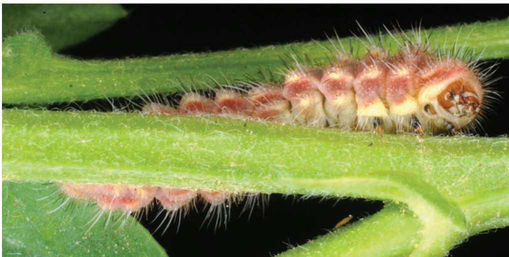
Fig. 1. Final stage larva of T. ballus with brown head.

The lengths of the oldest larvae collected ranged between 12 and 15 mm; the colour of the cephalic capsule at this age is light brown (Figure 1). Larval morphology, like the pattern and colouration, are typical of this family of