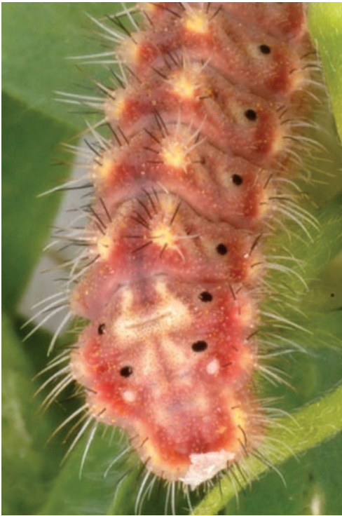
Fig. 7. Detail of the posterior segments of the larva of T. ballus showing the myrmecophilus organs.