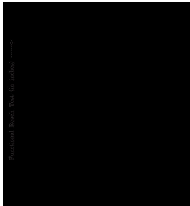
Fig. 1: Comparison of FRT values (for balance) in males and females of both non-obese and obese group ( P<0.001 ).

between them. Males are having more balance than females of non-obese group which was significant at P<0.001 when unpaired t-test was applied between non-obese males and females. It was found by applying unpaired t-test, that the degree of toe out and step width between males and females of non-obese group were insignificant ( P>0.05 ).