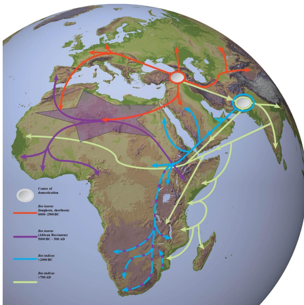
Figure 1. Approximate migration route and the origin of Africa domestic cattle (adapted and modified from ILRI, 2006. Safeguarding livestock diversity: the time is now). Circle regions represent the expected center of cattle domestication. Migration route from the outside Africa and within Africa was shown by color arrows, and the color of arrow represents the migration time and its origin.

coast from the 7th century AD. The second wave of Bos indicus , perhaps followed the rinderpest epidemics of 19th century, which wiped out most of African cattle population.