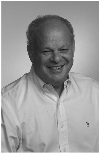
Martin E. P. Seligman