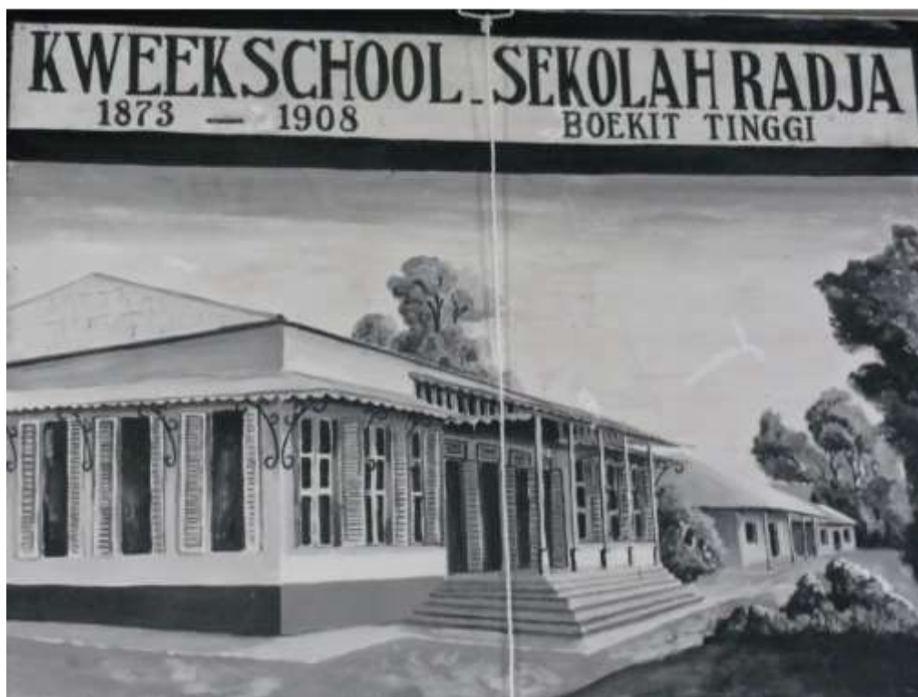
Figure 1: Kweek School Sekolah Radja zaman dulu kurun waktu 1873-1908