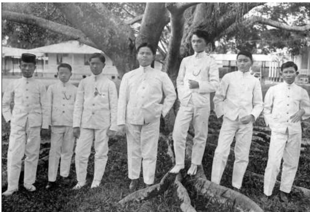
Figure 2: "Een groep leerlingen van de kweekschool te Fort de Kock" Sebuah kelompok siswa dari sekolah guru di Fort de Kock.

An unidentified photograph, with no known photographer or year of creation, depicts seven male students of the Kweekschool in Fort de Kock. The seven students are shown confidently standing under a tree in the schoolyard. Six students are facing the camera, while one student standing on the tree roots is looking towards the left of the camera. They are dressed in closed jackets, white trousers, and shoes. One student wearing a cap resembling a "pici" is standing on the left side.