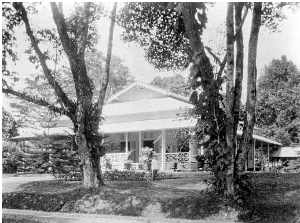
Figure 3: Rumah Kepala Sekolah Kweekschool te Fort de Kock, Tahun 1900-1940

In reality, the primary goal of the Dutch East Indies government in providing education to the indigenous population was to obtain educated labor at low cost, as employing administrative government officials or workers from the Netherlands would incur significant expenses. Van den Bosch, who served as the Governor-General of the Dutch East Indies during the period 1829-1834, felt that without the assistance of educated indigenous people, the economic development in the Dutch East Indies, which was his main task, would not succeed. For this purpose, education for the indigenous population was opened, from elementary schools to colleges, so that the implementation of the Cultivation System could generate significant profits and improve the economic conditions of the Netherlands.