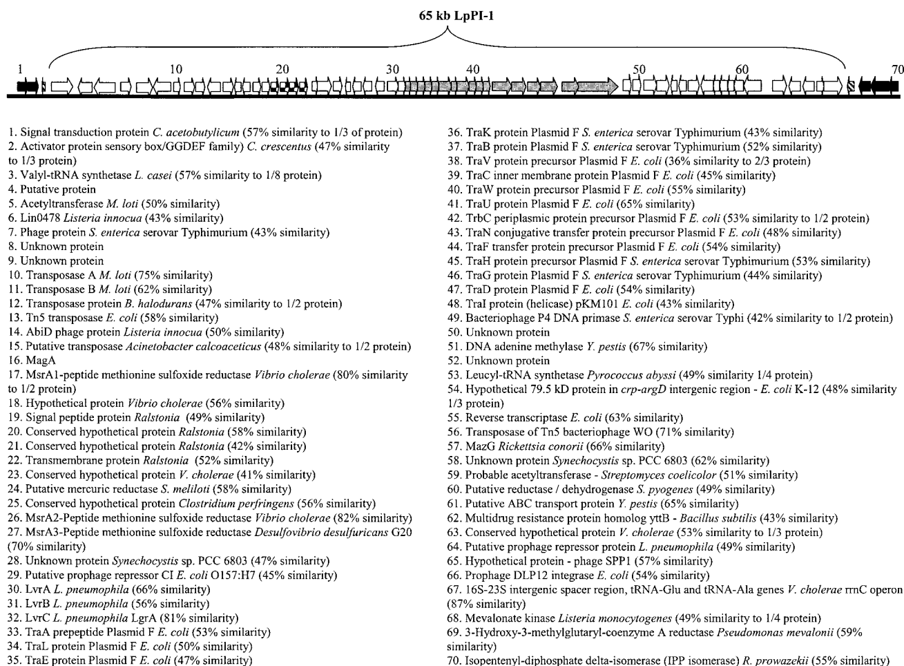
FIG. 1. Identification of genes within the L. pneumophila serogroup 1 strain Philadelphia-1 ~65-kb LpPI-1 locus on the basis of protein homology searches. Striped arrow boxes indicate the borders of the LpPI-1 locus, checkered arrow boxes refer to the conserved gene arrangement also observed on R. solanacearum megaplasmid, and gray solid arrow boxes refer to the conserved gene arrangement observed also in E. coli plasmid F. Arrow boxes are not drawn to scale. See text for details.

various L. pneumophila strains are depicted in Fig. 2. Standard PCRs (34) with each primer set were performed with 50- \mu l reaction volumes in a GeneAmp system 2400 (Perkin-Elmer) or a PTC programmable thermocycler (MJ Research, Inc.) for 25 cycles, and the products were subjected to agarose gel electrophoresis for analysis. The presence or absence of appropriate DNA bands was considered to be a positive or negative result, respectively, and the results are tabulated in Fig. 2. The results were confirmed by Southern blot analysis with the ECL direct nucleic acid labeling and detection system kit (Amersham Pharmacia Biotech), and probes were PCR amplified with the oligonucleotides listed in Table 2.