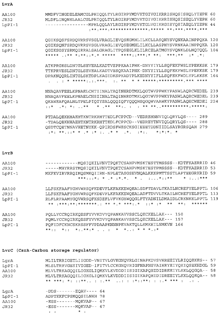
FIG. 4. ClustalW analysis of the amino acid sequences of the LvrA, LvrB, and LvrC (CsrA-LgrA) proteins encoded by the genomic prpA-lvrA-lvrB-lvrC gene cluster of L. pneumophila serogroup 1 strains AA100 and JR32 and the LpPI-1 prpA-lvrA-lvrB-lvrC gene cluster. Asterisks indicate identical residues, colons indicate similar residues with conserved codon base pair substitutions, and dots indicate residues with reduced similarity, as the codon base pair substitutions are semiconserved). The JR32 prpA-lvrA-lvrB-lvrC sequences are identical to those in the lvh locus of L. pneumophila serogroup 1 strain Philadelphia-1 currently being sequenced by the Columbia Legionella Genome Project. Note the genetic variability of the genes in the LpPI-1 locus in comparison to the genomic genes of strains AA100 and JR32.

negatively regulates stationary-phase and virulence genes (31). A third csrA homologue gene ( lgrA ) is associated with the lipopolysaccharide biosynthesis gene cluster in L. pneumophila serogroup 1 strain Philadelphia-1 (14). LgrA is 88% homologous to E. coli CsrA; however, it has only 38 and 63% amino acid identity to Lvh LvrC and LpPI-1 LvrC, respectively (Fig. 4). While the functions of Lvh LvrC and LpPI-1 LvrC are not known, a function of LgrA has been elucidated. lgrA can com-