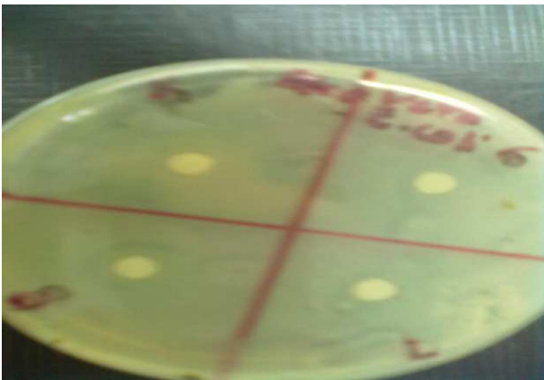
Figure 2. Aloe Vera Ethanol and Methanol Extracts with E.coli