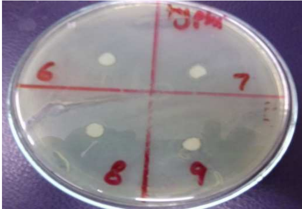
Figure 7. Aloe Vera column fractions 6, 7, 8 and 9 with S. typhi

Aloe Vera leaves were used to check the antibacterial activity during this study.