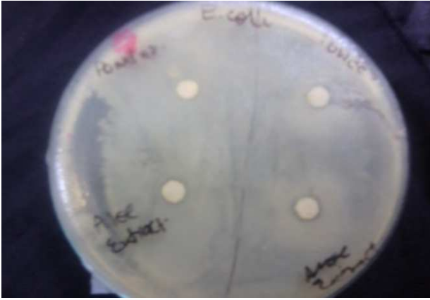
Figure 1. Aloe Vera Aqueous Extract with E.coli

the Figures (5-10) and measured of zone of inhibition is mentioned in Table 2. Graphical presentation of comparison of different column fractions of Aloe Vera is shown in Figure 11.