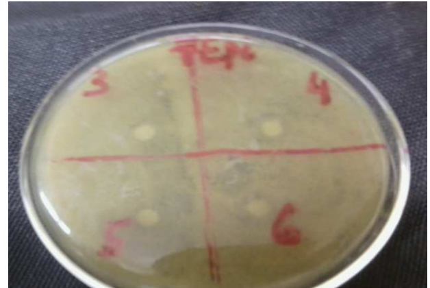
Figure 10. Aloe Vera Column Fractions 3, 4, 5 and 6 with S. epidermitis