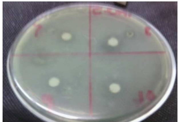
Figure 5. Aloe Vera Column Fractions 7, 8, 9 and 10 with E.coli