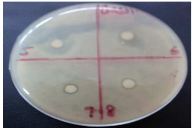
Figure 6. Aloe Vera Column Fractions 5, 6, 7 and 8 with B. subtilus