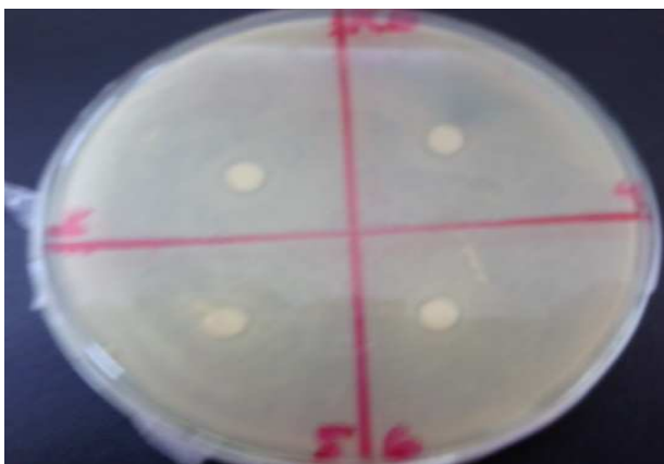
Figure 8. Aloe Vera Column Fractions 5, 6, 7 and 8 with Pseudomonas