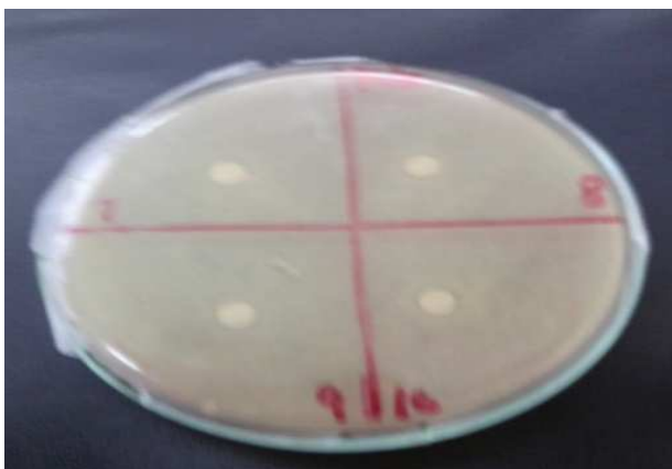
Figure 9. Aloe Vera column fractions 7, 8, 9 and 10 with Klebsiella