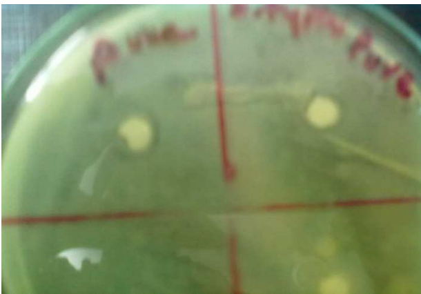
Figure 3. Aloe Vera Aqueous Extract with B.Subtillus