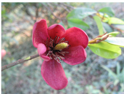
Fig. 3. Flower of Michelia crassipes (♀) in full sun in the morning.