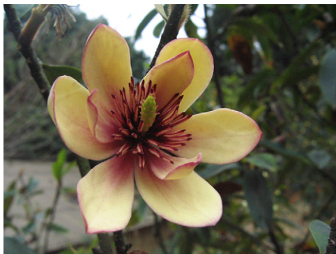
Fig. 2. Flower of Michelia 'Yanzhizui' in full sun in the morning.