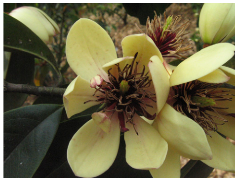
Fig. 1. Flower of Michelia ‘Chilongzhua’ in full sun in the morning.

M. ‘Yanzhizui’ (Fig. 2) is an evergreen, broadly columnar, upright shrub that reaches 2.4 m high and 1.8 m wide after 7 years of field growth under full sun conditions in Kunming. The leaves are thick, leathery with dark green (RHS 139A) abaxial surface and a green (RHS 138B) ventral surface and short yellow hairs on the middle veins. The surfaces of buds, peduncles, leafstalks of young leaves, and twigs have dense long grayed orange (RHS 175A) hairs. Leaves are elliptic, up to 14.2 cm long × 5.1 cm wide, narrow, short acuminate at the tip and wedge-shaped convex at the base with entire leaf margins. Tepals number from seven to 10 in three to four whorls. Flowers are green–yellow (RHS 1D) on the upper surface and pale yellow (RHS 4D) on the lower surface with red–purple (RHS 67C) edges in full sunlight (Fig. 2). The fragrant flowers have rose–purple streaks, marking the outside of the base of tepals. The flower center is red–purple (RHS 64C) on the margin, becoming deep red–purple (RHS 64B) toward the center of the flowers (Fig. 2). Purple stamens have dark red–purple (RHS 59A)