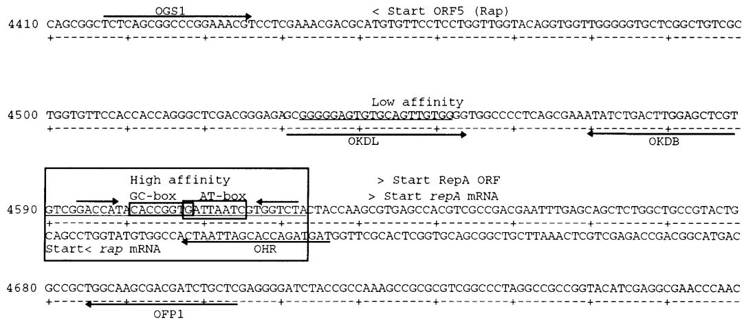
Figure 1. DNA sequence of the ori region of pAL5000. The low-affinity binding site for RepB is underlined; the high-affinity binding site is boxed. The GC-box and AT-box motifs are boxed. Sequences corresponding to some of the oligonucleotides used in the analyses are represented by arrows pointing in the 5'-3' direction of the oligonucleotide. Arrowheads mark start points for transcripts and open reading frames, respectively. For the region around the H-site, both strands of the DNA sequence are shown.

exceptions (10–13) most work has been sequence comparisons of areas upstream of transcription start points.