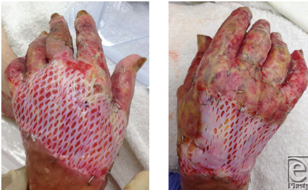
Figure 1. Bilateral hand wounds 5 days after application of fetal bovine dermal scaffold.

Meshed cadaveric homograft was initially applied after escharotomy to protect underlying structures and promote granulation tissue for future autografting. After homograft excision, several areas of her hands remained partially avascular. PriMatrix dermal substitute was applied to provide protection and promote neovascularization for future skin grafting. The patient's wounds were unveiled 5 days after PriMatrix placement, and granulation tissue was present over the prior avascular extensor surfaces (Fig 1). Daily dressing changes ensured a moist wound environment (Fig 2). She underwent split-thickness skin grafting 2 weeks after PriMatrix application (Fig 3). Her wounds completely closed, and the patient was discharged to rehabilitation to continue physical therapy.