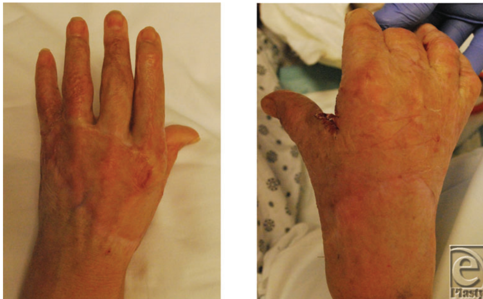
Figure 4. Bilateral hand wounds 9 months after application of split-thickness skin grafts.

While the initial primary goal in our burn patient was limb salvage and wound coverage, hand function is an important long-term goal. Our patient's hand burns healed completely with FBDS (Fig 4). However, despite splinting and aggressive physical therapy, diffuse scarring and significant contracture compromised her hand function. Other acellular scaffolds have been efficacious in treating burn contractures. A study by Askari and colleagues demonstrated healing of 9 patients with burn contractures treated with acellular dermal matrix. These patients experienced a significant increase in passive range of motion and web space lengthening. 26 We attributed our patient's diffuse scarring to poor compliance due to her confused mental state. She eventually required surgical contracture release and local flap reconstruction 1 year after her initial incident. Her mental status has improved and she has gone on to achieve satisfactory functional recovery relative to the severity of the injury.