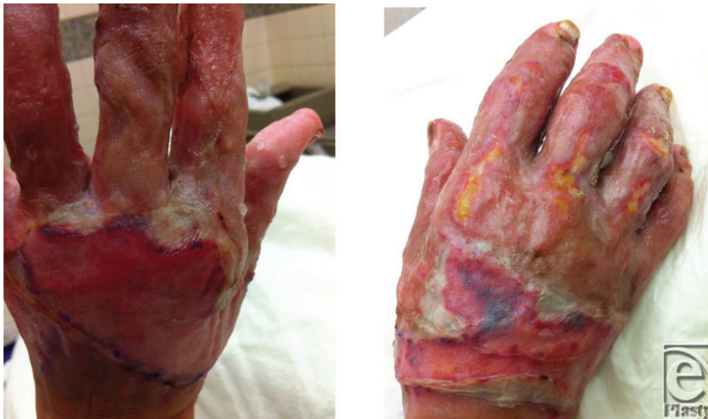
Figure 3. Bilateral hand wounds 5 days after application of split-thickness skin grafts.

Karr 17 conducted a retrospective comparison of PriMatrix and Apligraf (Organogenesis Inc, Canton, Massachusetts) and demonstrated accelerated healing in the PriMatrix group for the treatment of refractory diabetic foot and venous stasis ulcers despite larger initial wound size. While initially expensive, the authors argue that PriMatrix is cost-effective due to shorter healing times, decreased treatment visits, and fewer complications. 18,19 Likewise, a study by Kavros 20 showed PriMatrix to be efficacious in accelerating healing of 20 chronic neuropathic ulcerations compared to daily local wound care with