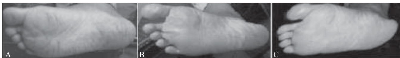
Fig. 1: Photographs showing clinical efficacy of foot care cream. A, B and C represent clinical conditions on 0 d, after 4 w and after 8 w period, respectively.

Overall, mango butter has a high potential to yield excellent emolliency which rebuilds a naturally