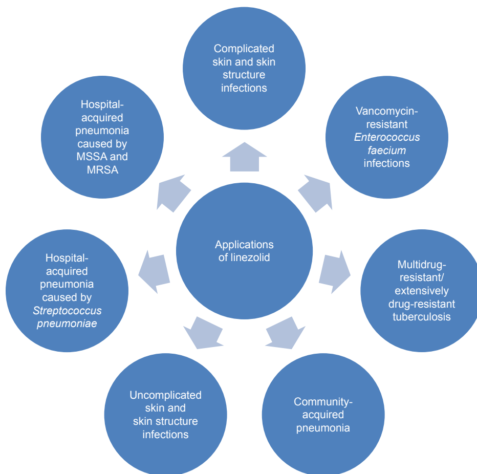
Figure 2 Pictorial representation of the linezolid applications.

Abbreviations: MSSA, methicillin-susceptible Staphylococcus aureus ; MRSA, methicillin-resistant S. aureus .