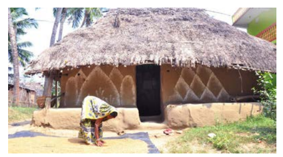
Fig. 3. A typical structure of house built by farmers and other people in rural areas where they stay as well as store their harvested agricultural products. Roof is made up of rice straw and the walls are made up of clay.