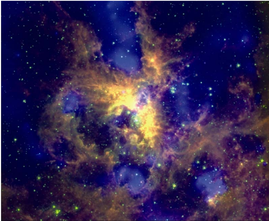
Figure 3: The central 200pc of 30 Doradus as imaged by Chandra ACIS (blue: 500-700eV) and Spitzer IRAC (green: 3.2-4.0 \mu\text{m} , red: 6.5-9.4 \mu\text{m} ) (Brandl et al. 2005).