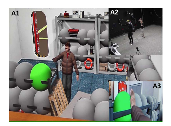
Figure 1. Full immersion VR experiment. The virtual environment (A1, bird's-eye view) is rendered in real time (A3, ego view) and shown to the subject via a high resolution headmounted display (A2, physical environment). doi:10.1371/journal.pone.0109622.g001

Ten out of the thirteen subjects were able to return and participate in an MRI scan session six to twelve months after the virtual reality visits (two subjects moved out of town and one subject did not respond to our follow up contacts). Each scan session consisted of: (1) a high-resolution anatomical scan, (2) two 8 minute eyes-open resting-state scans and (3) a field map to measure magnetic field inhomogeneities. For the resting-state