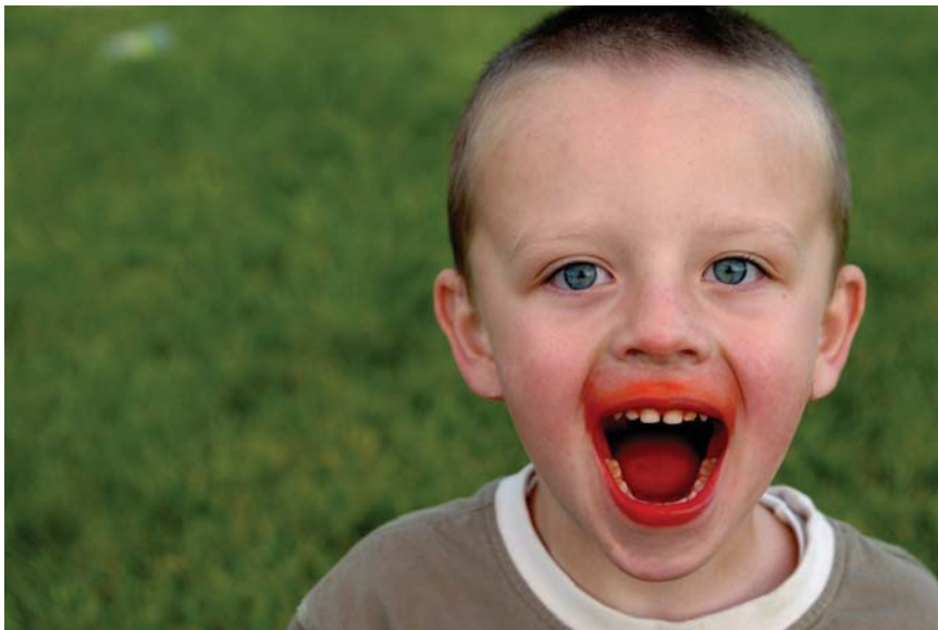
Dyeing for more data. The question of whether food additives such as colorings contribute significantly to hyperactivity remains open.