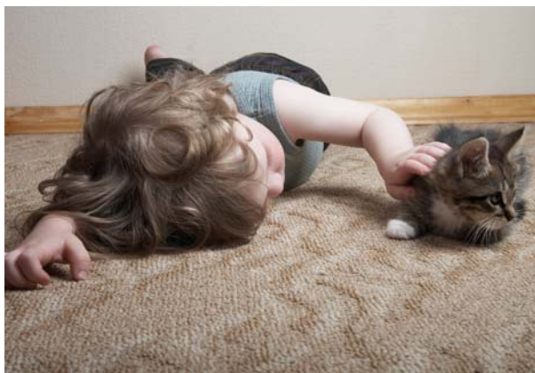
Taking a cue from kitty. Health effects seen in cats exposed to PBDEs may offer insights into how these chemicals affect humans.

Dye looked at whether hyperthyroidal cats had greater body burdens of PBDEs. She and her colleagues measured numerous PBDE congeners in serum samples collected from 23 cats, 11 of which were positive for FH. They report in the 15 September 2007 Environmental Science & Technology that total average PBDE levels were three times higher in older cats with FH than in younger cats without FH, but the difference was not statistically significant because of high within-group variability. “All cats are high [compared with humans], and some cats are incredibly high,”