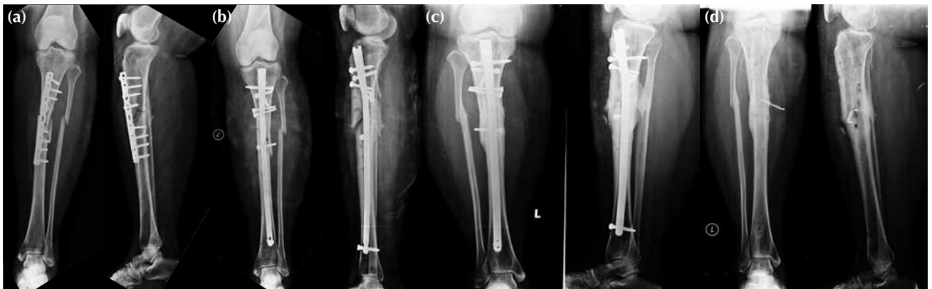
Figure 3 Radiographs showing (a) non-union of a proximal tibial fracture fixed with a dynamic compression plate, (b) revision with intramedullary nailing supplemented with Poller screws, (c) good callus formation and alignment at month 6, and (d) after nail removal.

Stainless steel or titanium solid tibial nails were used, the most common size being 9-mm in diameter. Locking cortical screws of 3.5 or 4.5 mm were used for blocking. All nails were high bend nails with a bend of 11° near the proximal tip of the nail. Poller screws were used to maintain alignment or to improve the stability of the bone-implant complex or to control the nail during insertion. In 45 cases, a single Poller screw was placed on the concave side of the deformity. In 27 and 3 cases, 2 and 3 Poller screws were placed, respectively.