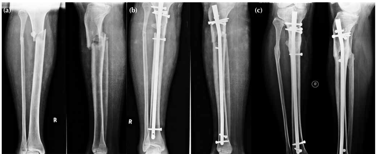
Figure 1 Radiographs showing (a) a closed proximal tibial fracture, (b) closed reduction and intramedullary nailing supplemented with Poller screws, and (c) complete bone union with good callus formation at month 6, with a full range of knee motion.

Between November 2006 and December 2010, 50 men and 20 women (75 fractures) aged 18 to 65 (mean, 33) years underwent intramedullary nailing supplemented with Poller screws for acutely displaced