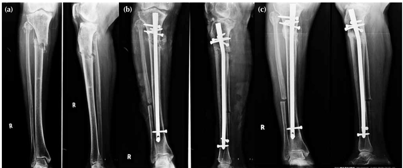
Figure 2 Radiographs showing (a) a proximal tibial shaft fracture with delayed union, (b) fibulectomy and revision with intramedullary nailing supplemented with Poller screws, and (c) good callus formation and bone union at month 6.