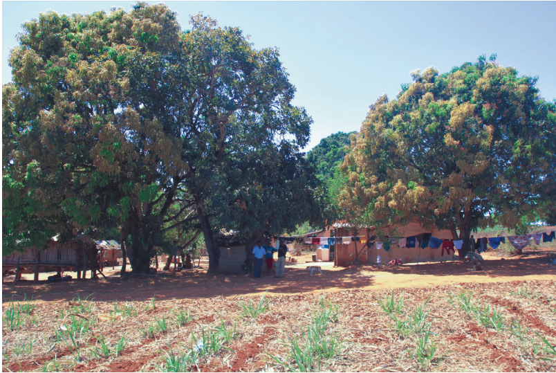
Figure 2: Sugarcane cultivation directly adjacent to the gardens of the quilombolas , Photo: Langer 2014.

approximately 75 % of the harvest. Besides a few permanent workers, almost exclusively seasonal workers are contracted for the period of the harvest. The owners, managers, and large part of the workforce live in the small town of Pompéu in order to maintain a relatively urban and modern lifestyle. In addition to sugarcane producers, sugar and ethanol producers, intermediate-product companies, and upstream and downstream service providers, these growth- and market-oriented logics also involve state agencies that support the interests of the relevant actors through support programs (e. g. ProÁlcool), the provision of infrastructure (e. g. transport routes, agriculturally oriented educational institutions), and advisory services (e. g. state agricultural advisory agency Emater).