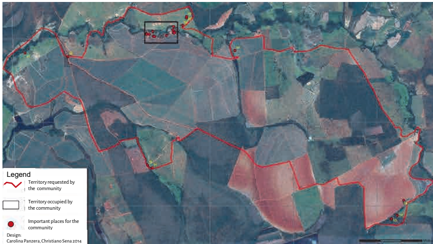
Figure 1: Territory of the Comunidade Quilombola do Saco Barreiro surrounded by sugarcane and eucalyptus plantations.

corresponding struggles and strategies can be analyzed based on the respective specific practices, discourses, and symbols, which are integrated into a variety of power relations and inscribed in the landscape in their historical entanglements.