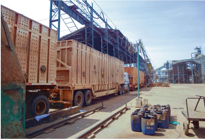
Figure 3: Agropéu factory and machinery – symbols of development and progress.