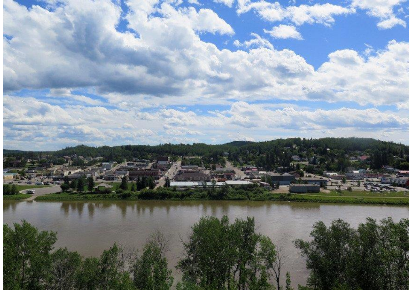
Town of Athabasca.