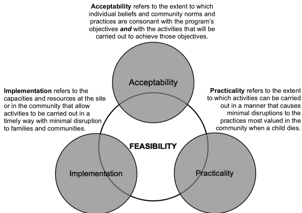
Figure 1. The conceptual framework for formative research to assess the feasibility of conducting mortality surveillance using minimally invasive tissue sampling across the Child Health and Mortality Prevention Surveillance network.

While the percentages cited above reflect the aggregate findings across all the PICK-CHAMP workshops conducted in that particular country site, there were instances of great discrepancies across different communities within the same site where workshops were conducted. This was most pronounced in South Africa. An analysis of participants' responses to the following 5 statements addressing mortality surveillance in exercise 6 of the community members' workshop demonstrates a broad range of responses: