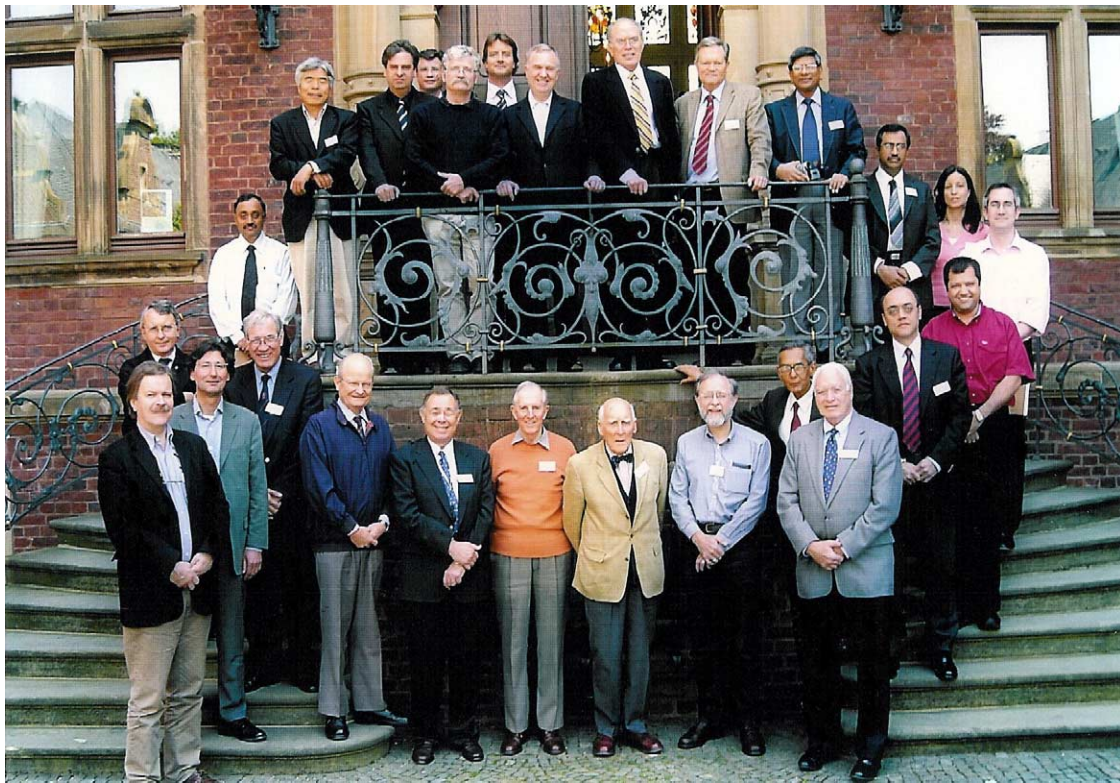
Fig. 1 Group photograph of the participants in the International Conference for the Development of Standards for the treatment of anorectal malformations. Names of the participants are listed in Table 1 .

agenesis without fistula in both sexes. The low-type malformations were classified as anovestibular fistula in the female and, in both sexes, as anocutaneous fistula and anal stenosis. This classification was widely accepted over the years and was based on detailed embryological and anatomic studies performed especially by Stephens et al [1] and Kelly [2] on anatomic sections and radiographic investigations. They recognized that the pubococcygeal line extending from the upper border of the os pubis to the os coccyx corresponds with the attachment of levator ani muscles to the pelvic wall, separating high-type malformations lying above the levator muscle and intermediate and low forms of anorectal agenesis lying below this anatomic line. Furthermore, in healthy individuals, the lowest point of the ischial tuberosity, the so-called I-point, represents the deepest point of the funnel of the levator ani muscles. Therefore, every blind rectal pouch, lying between the pubococcygeal line and the I-point, was classified as an intermediate anomaly and could be treated by a posterior sagittal anorectoplasty (PSARP) according to Peña [3] and De Vries [4]. Low lesions below the I-point could be easily managed from a perineal approach. Because of these anatomic relations, the Wingspread classification had a significant impact on the choice of surgical approach.