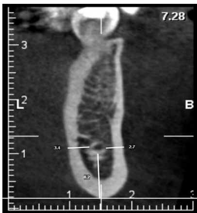
Fig. 2: Measuring the distance from the endmost point of the mandibular incisive canal to the buccal plate, lingual plate and the inferior border of the mandible

of 28% in a study by Mardinger et al, [3] to a maximum of 96% in a study by Arzouman et al [4]. There have also been different studies regarding the maximum length of the anterior loop with various results, suggesting to keep a minimum distance of 6mm between the mental foramen and the most posterior implant in the interforaminal area where there is no accurate measurement of the length of the anterior loop [5,6]. This 6-millimeter distance is because of the fact that the maximum length of the anterior loop has been determined to be 5mm in anatomical assessments [3,5]. Different studies on cadavers have indicated that the mandibular incisive canal is present in almost 100% of the cases [7-9]. During the placement of implant in this area, if adequate distance from this canal is not maintained, the surgical procedure can lead to an inflammation around the nerve that could extent into the major branches of mental nerve, resulting in sensory disturbances in this area [5].