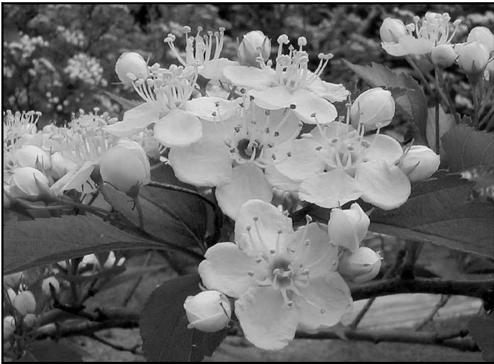
Crataegus laevigata (hawthorn).

important is the fact that many antiarrhythmic drugs are CYP 2D6 inhibitors, including quinidine, flecainide, and amiodarone. Caution is warranted in combining Scotch broom with other antiarrhythmics for this reason.